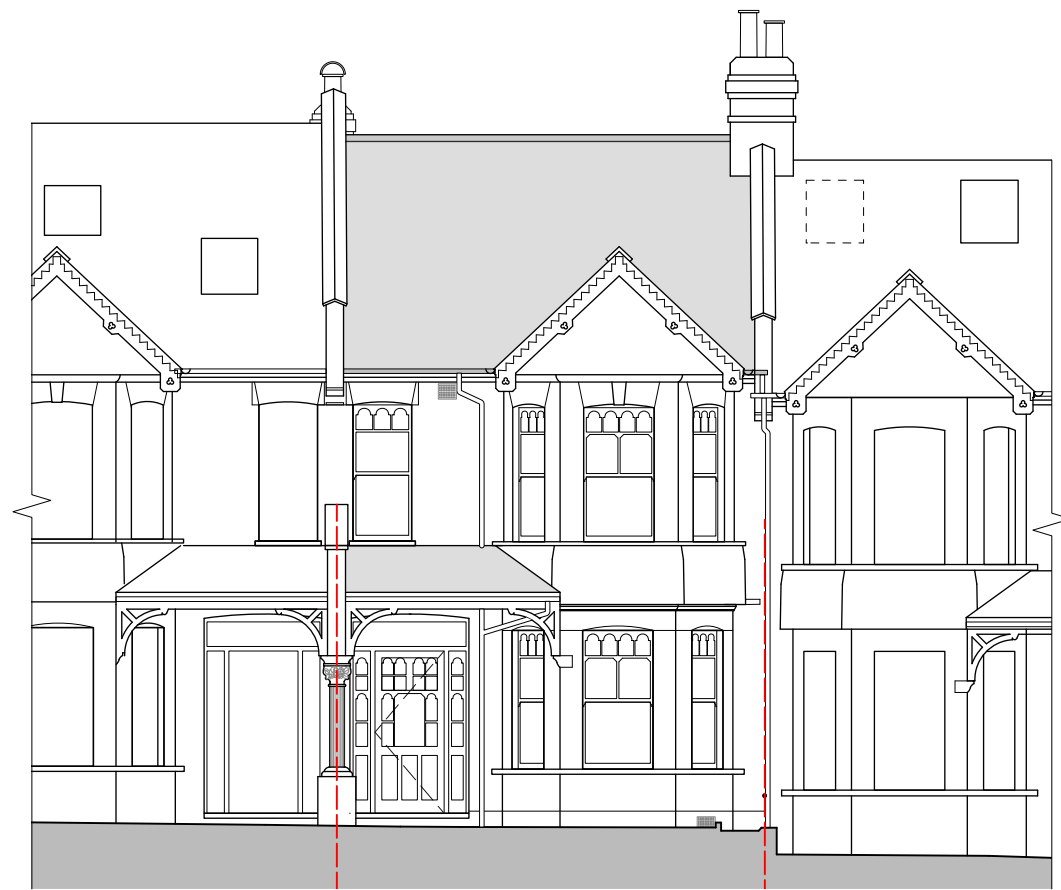
1 FRONT ELEVATION - EXISTING 1:100 @ A3