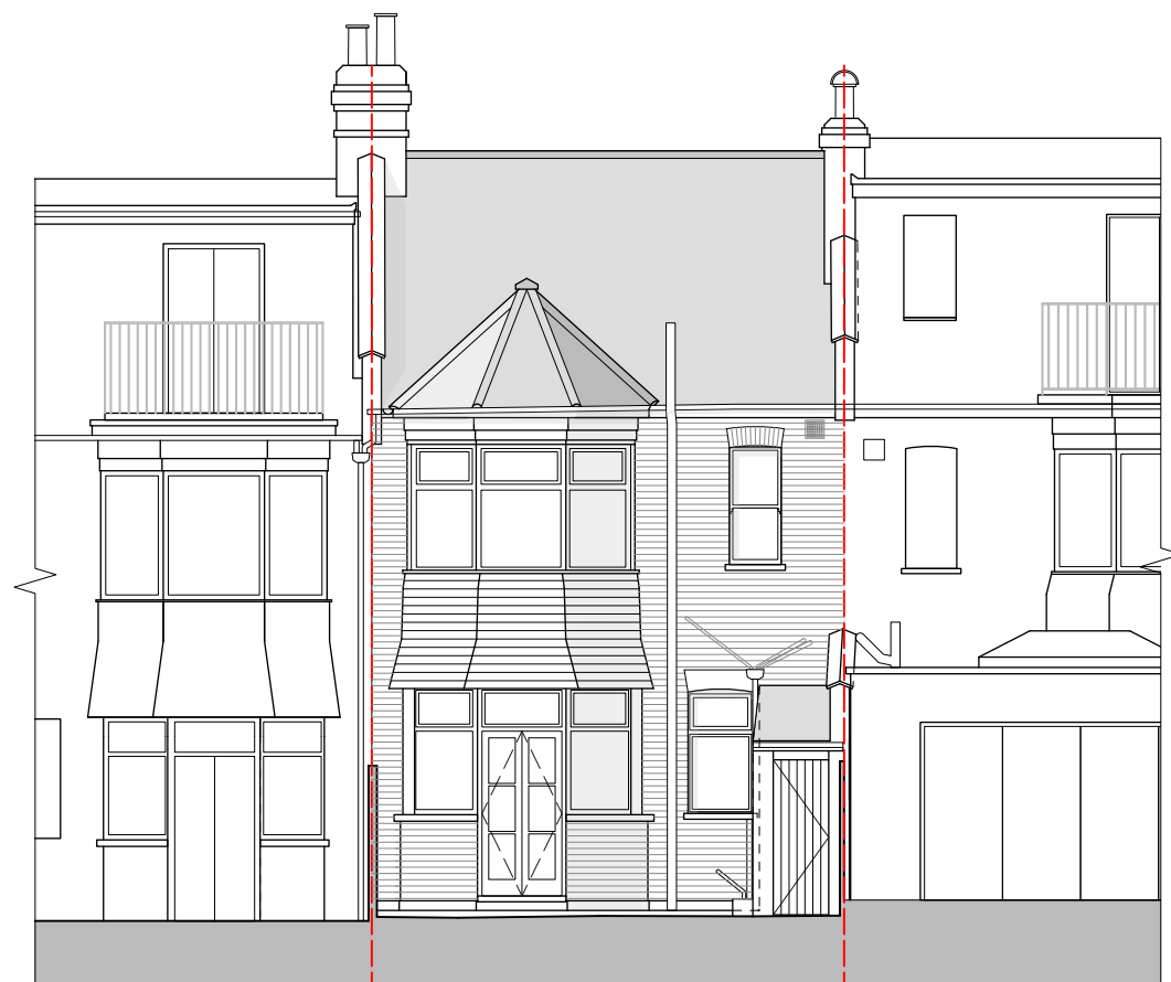
1 REAR ELEVATION - EXISTING 1:100 @ A3