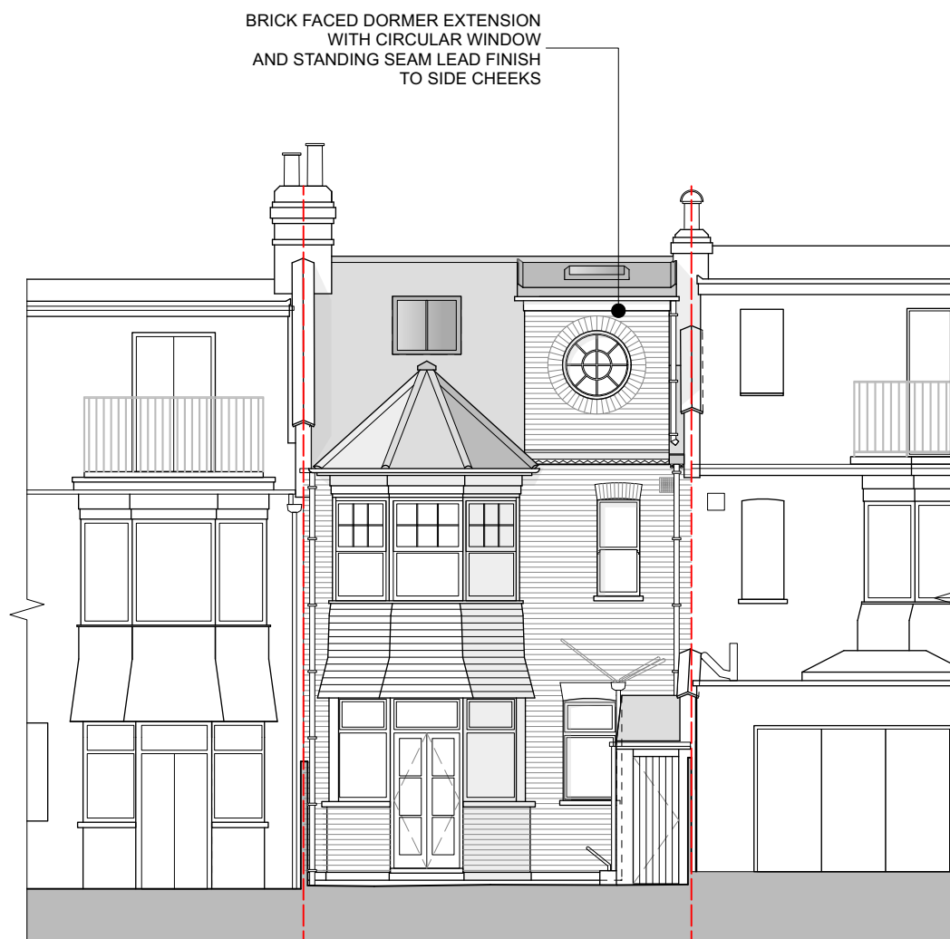
2 REAR ELEVATION - PROPOSED 1:100 @ A3

NOTES: DO NOT SCALE FROM THIS DRAWING. CONTRACTOR TO VERIFY ALL DIMENSIONS PRIOR TO CONSTRUCTION. ANY DISCREPANCIES ARE TO BE REPORTED TO THE ARCHITECT. REMOVE THIS DRAWING FROM CIRCULATION WHEN REVISED DRAWING IS ISSUED.