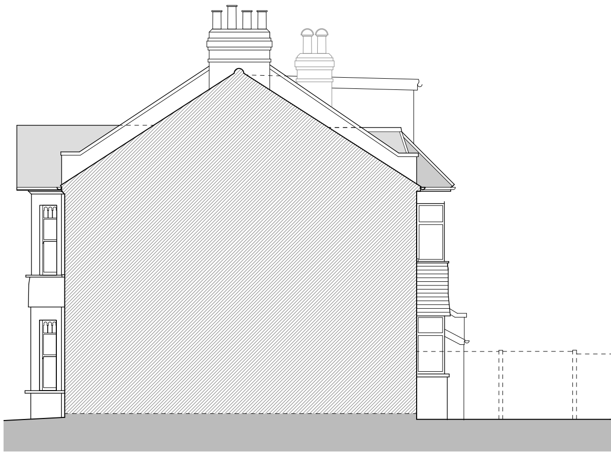
1 SIDE ELEVATION (WEST) - EXISTING 1:100 @ A3