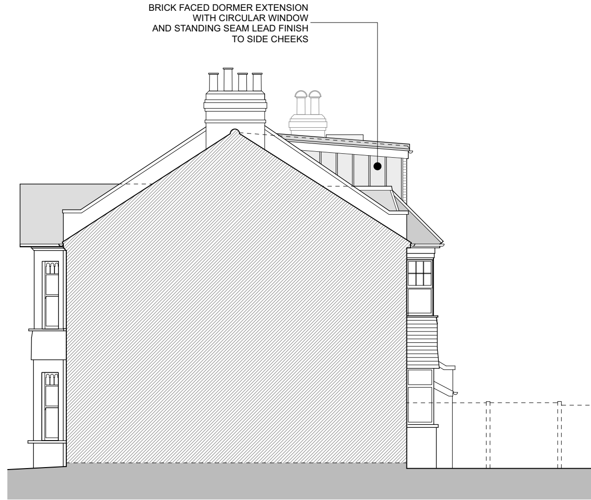
2 SIDE ELEVATION (WEST) - PROPOSED 1:100 @ A3