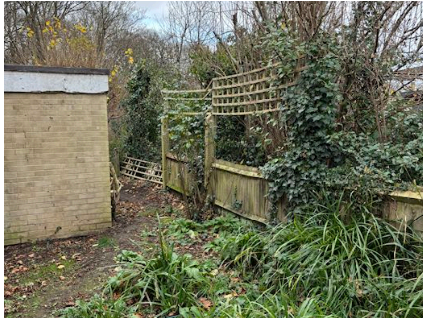
Existing fence at 2300 at highest point