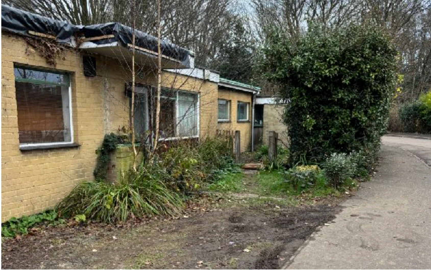
Current view from pavement exposing bedrooms and bathroom to public view