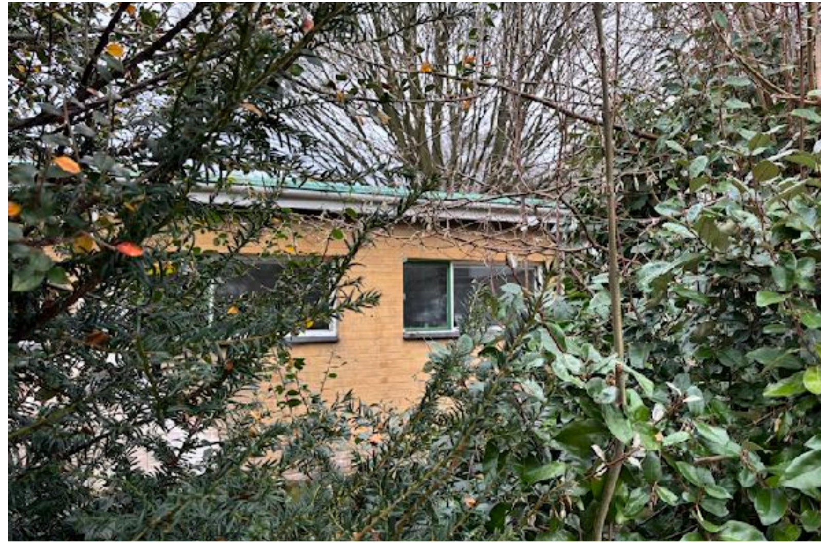
View from pavement through hedge into bedroom windows