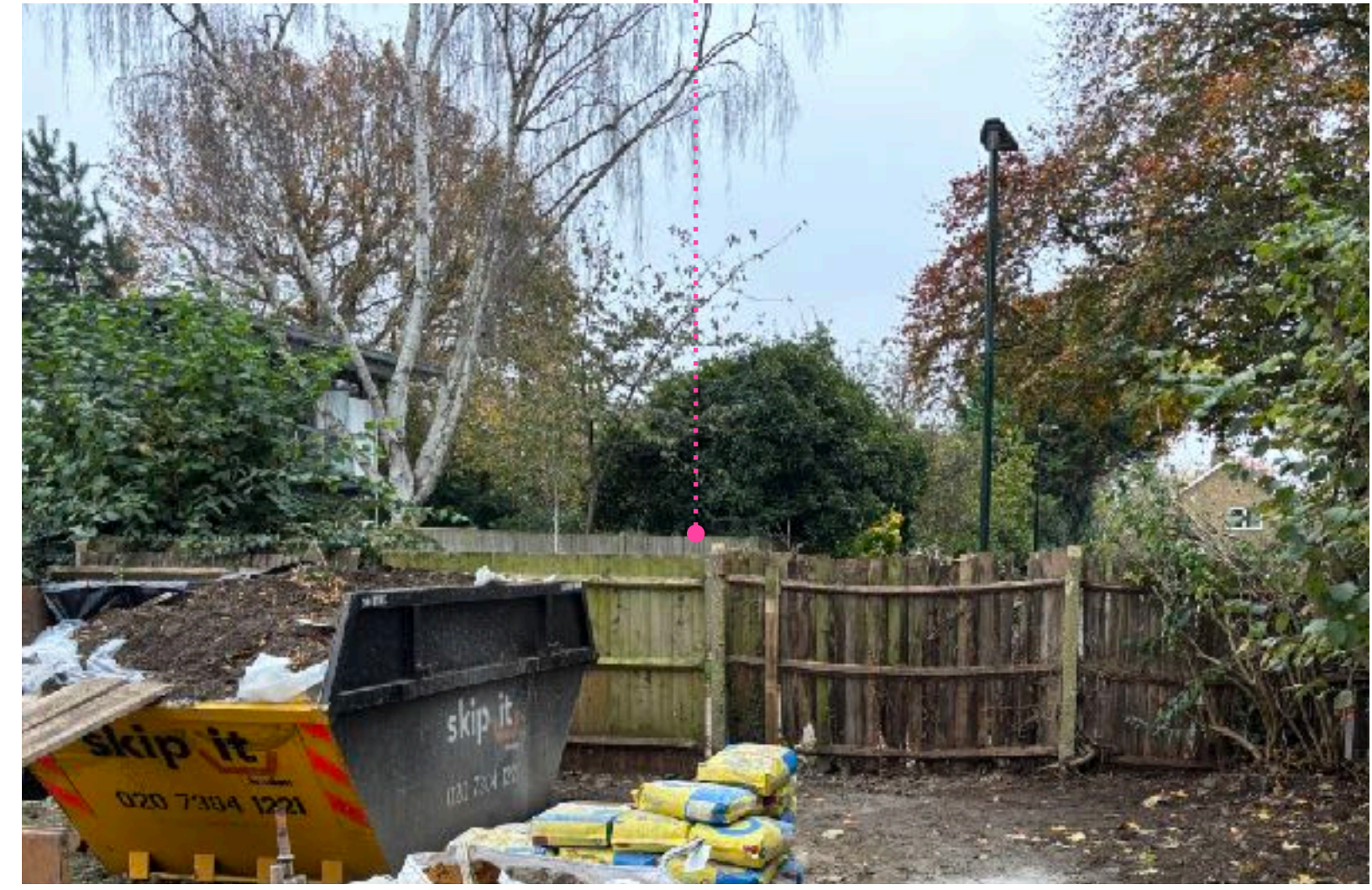
Fence at property opposite = 1950 high