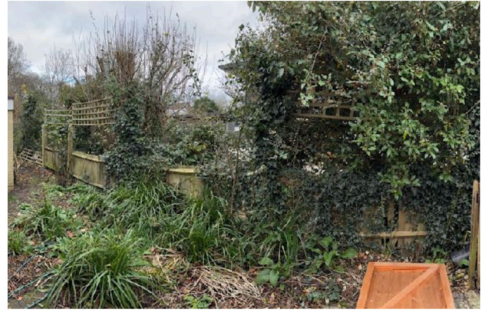
'Full' run of fence behind hedge