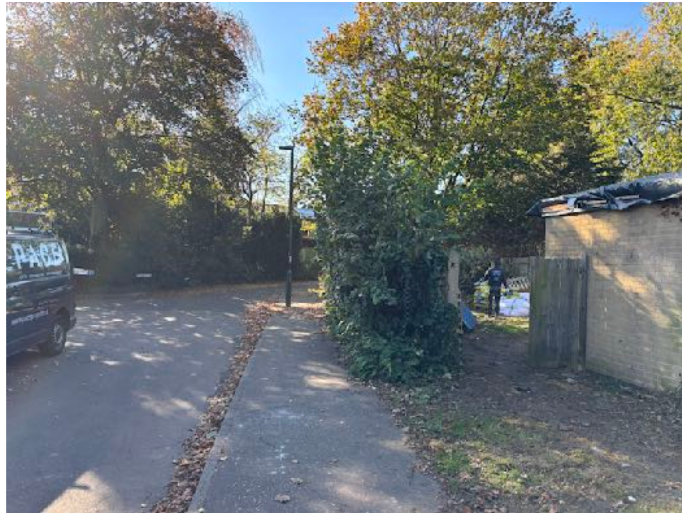
End of fence run outside annexe. Fenceline to be continued along side of property to screen bedrooms & bathrooms.