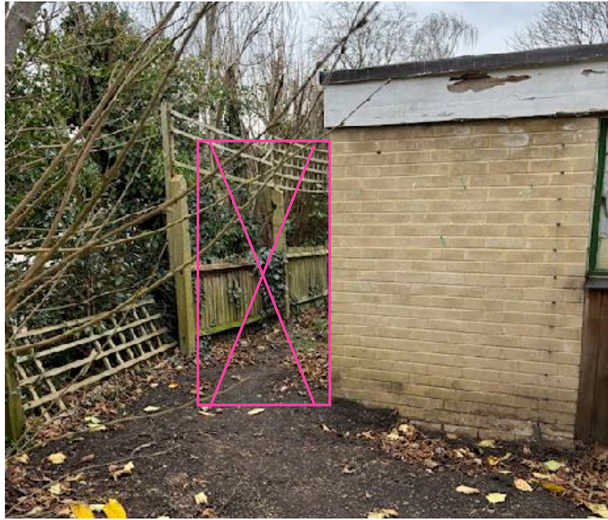
Proposed position of gate (B)