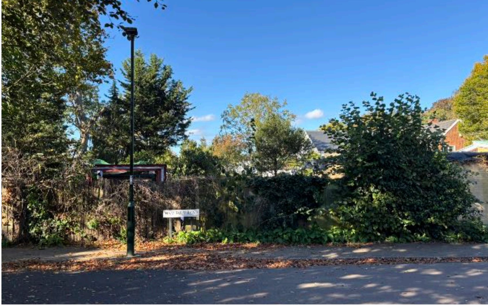
Main section of HFR fence to be replaced. Current height 1750