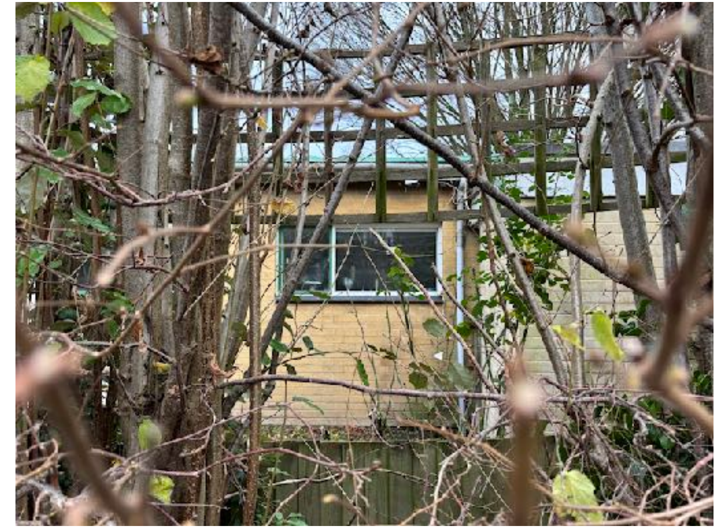
View from pavement through fence/hedge into 11 y/o daughter's bedroom