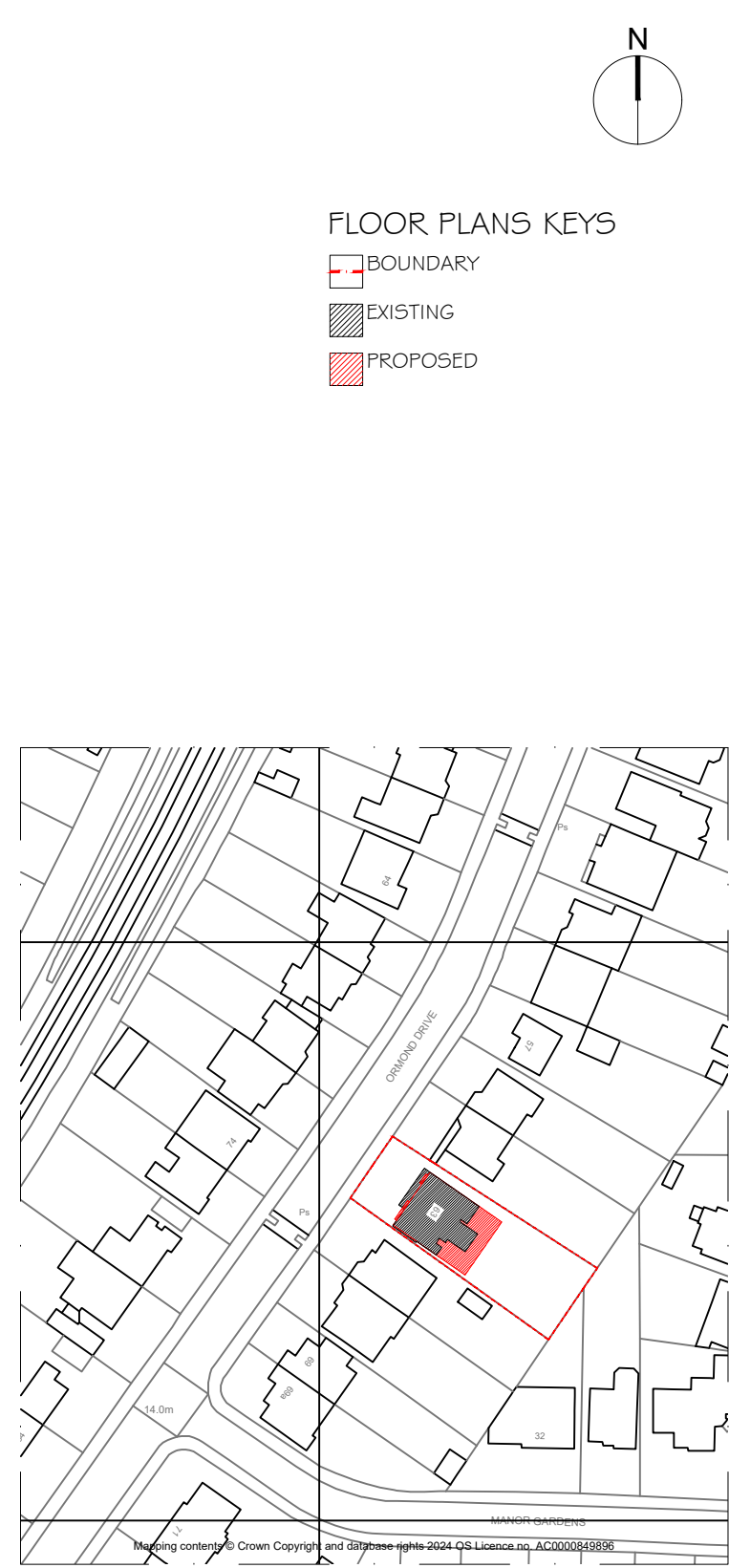
LOCATION PLAN 0 10m 50m 100m 1:1250