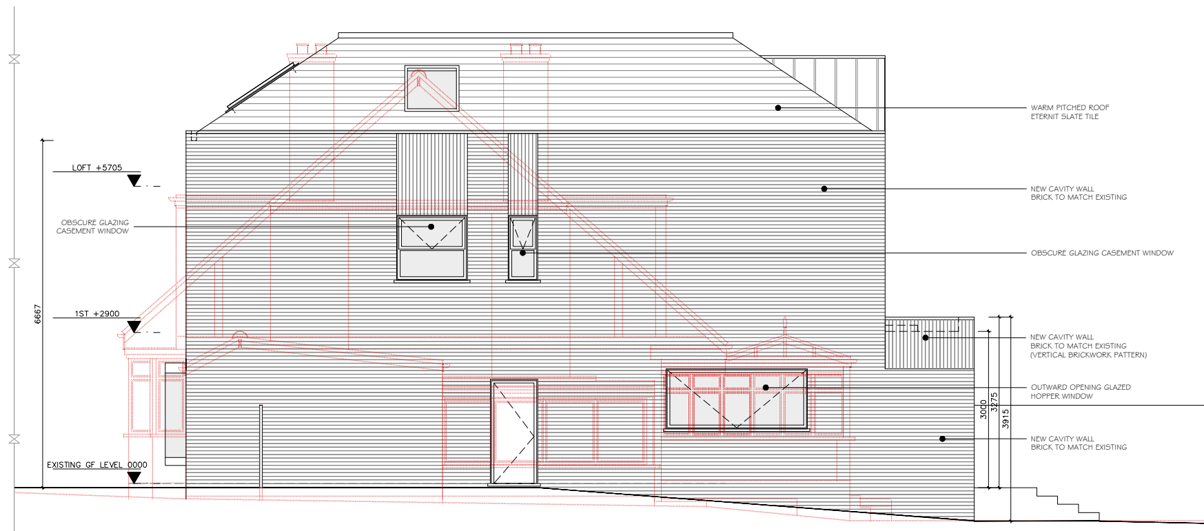
PROPOSED SIDE ELEVATION 02