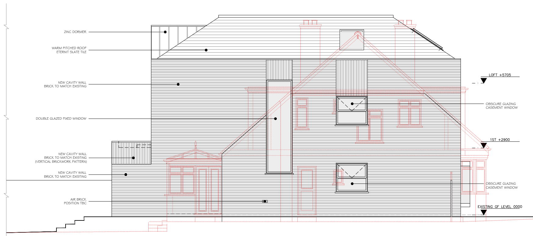
PROPOSED LEFT SIDE ELEVATION