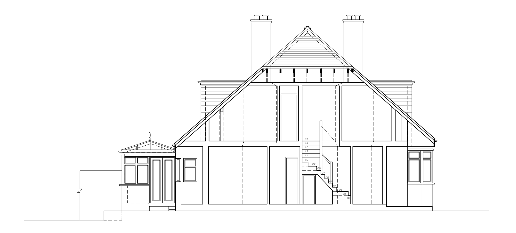
EXISTING SECTION A-A