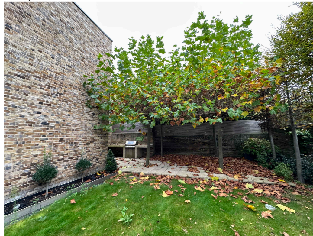
garden - looking towards location of new extensions