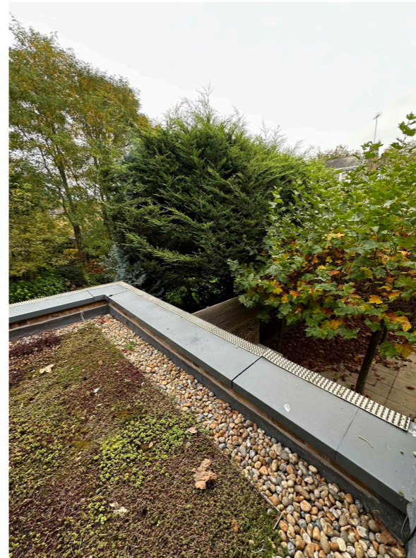
view from current first floor towards no.23+24 Beverley Road