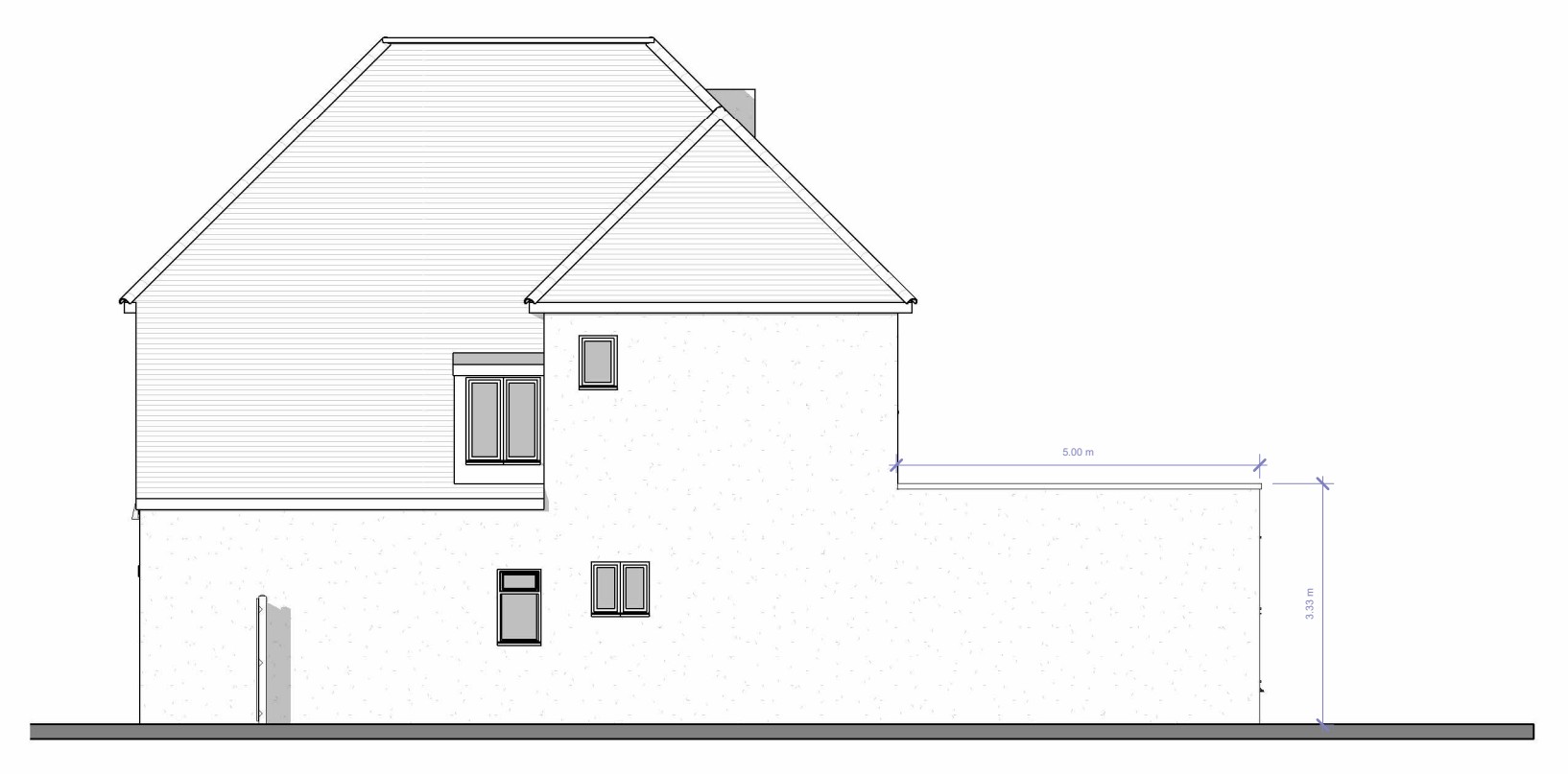
Side 2 Elevation