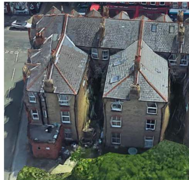
EXISTING AERIAL VIEW