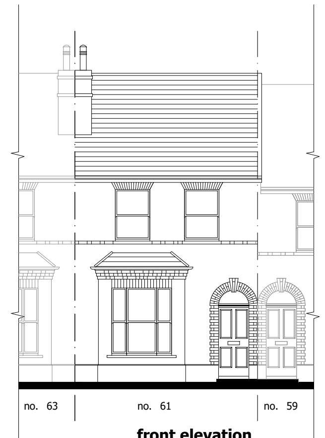
front elevation (no change)

loft conversion and extension at 61 Houblon Road TW10, E18