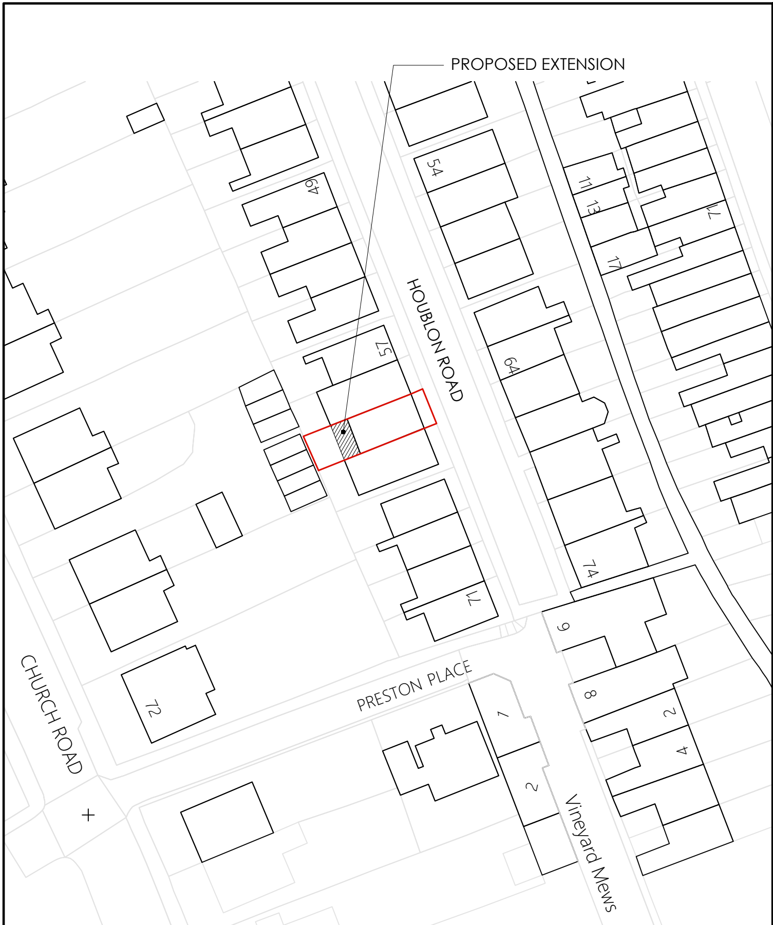
BLOCK PLAN (SCALE 1:500)