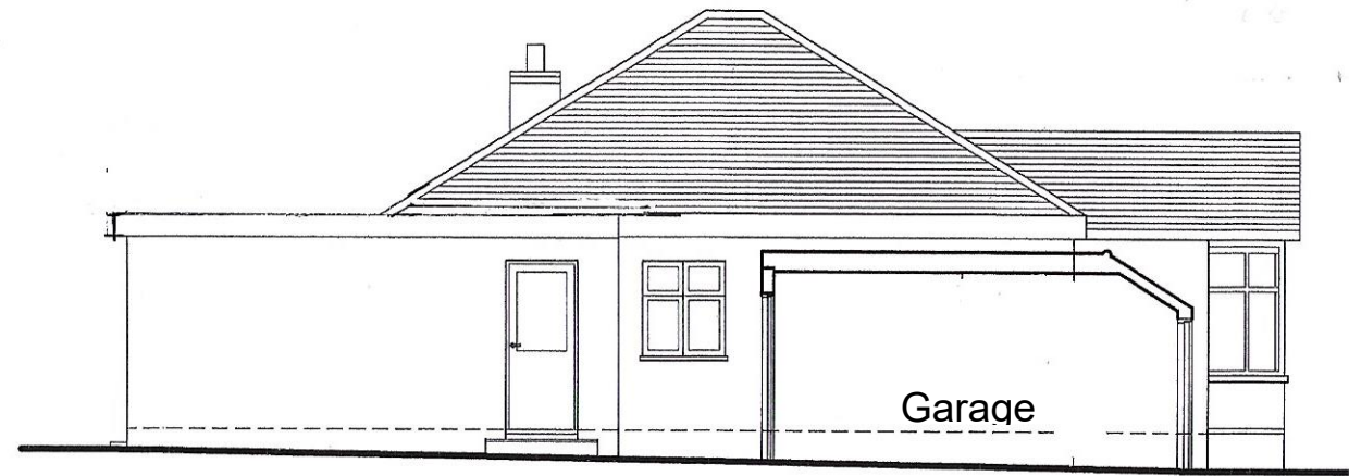
EXISTING SIDE ELEVATION / SECTION