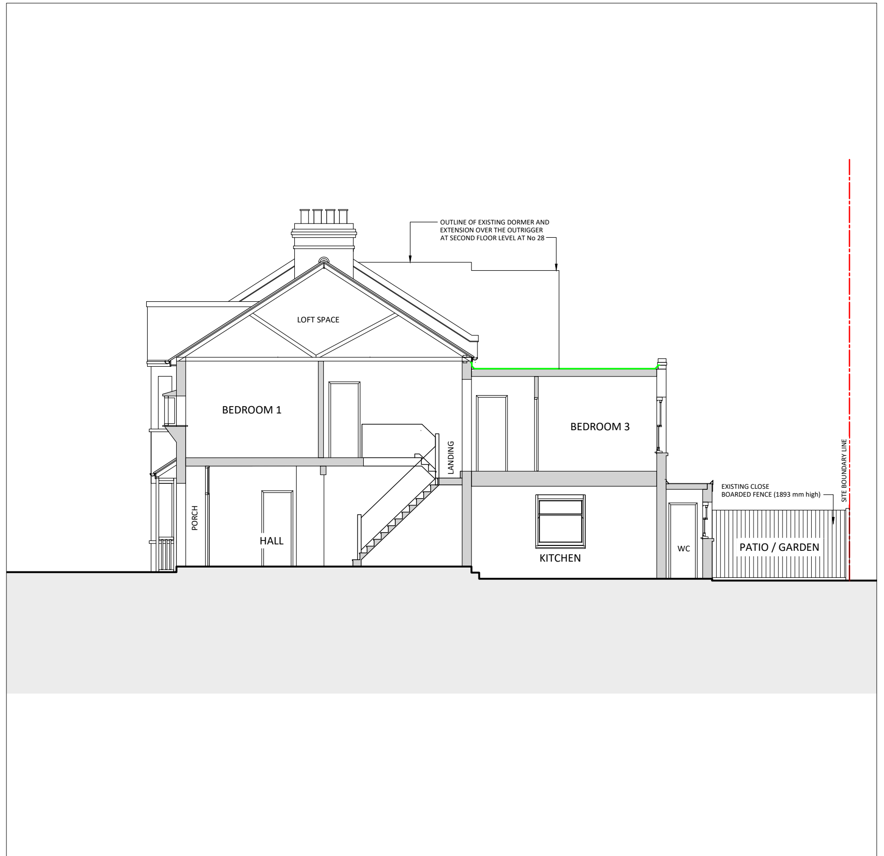
EXISTING SECTION 2