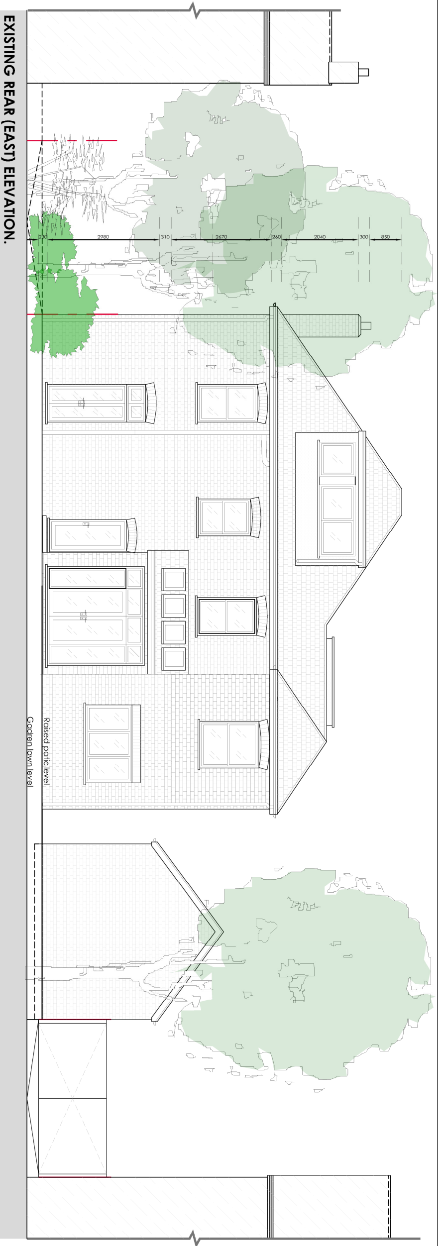
EXISTING REAR (EAST) ELEVATION.