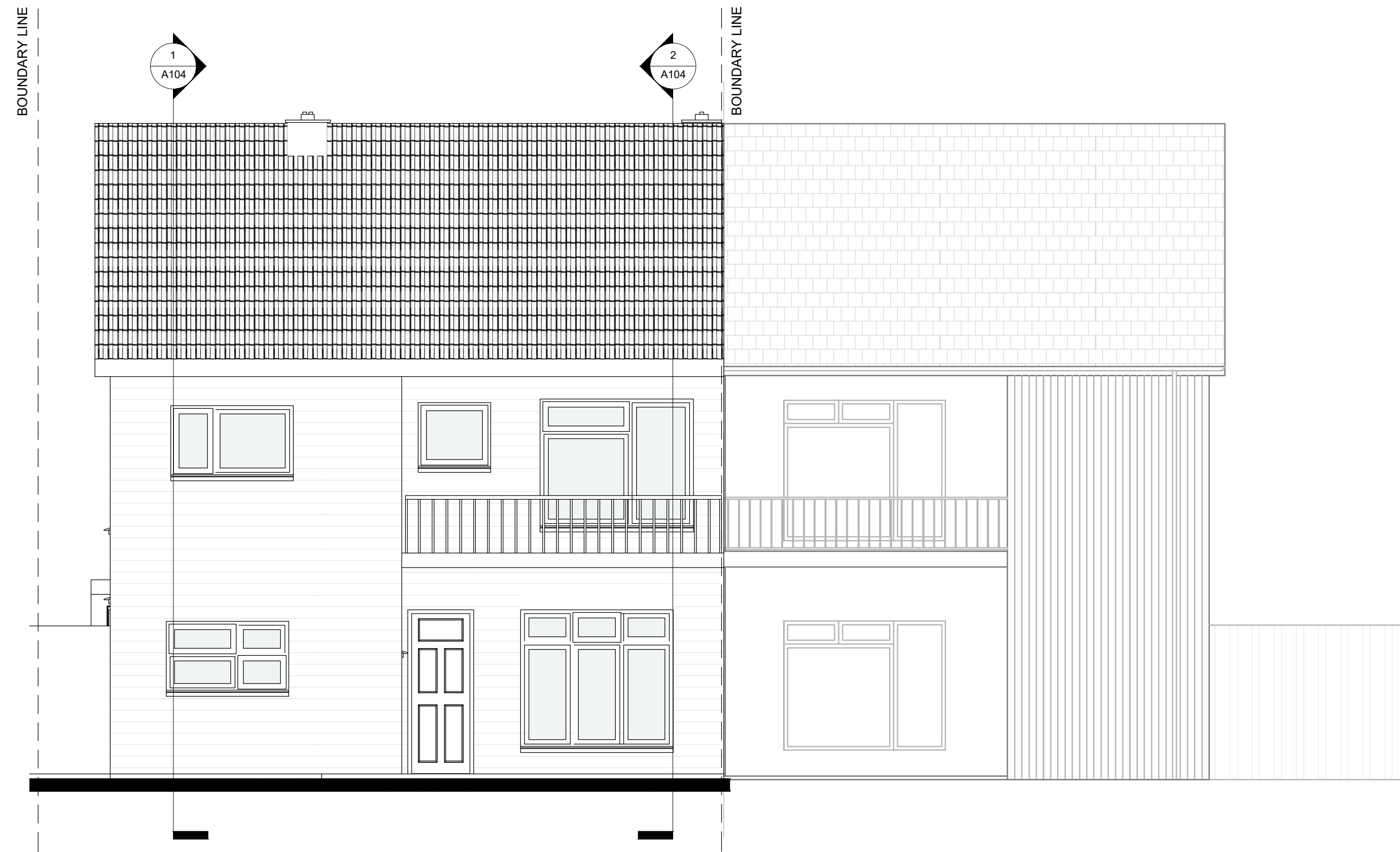
1 Existing Front Elevation 1 : 50