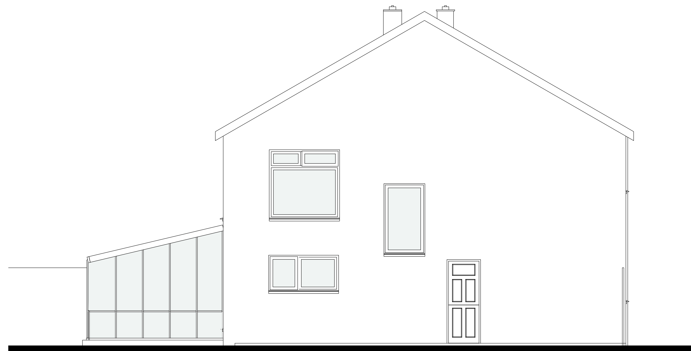
2 Existing West Elevation 1 : 50