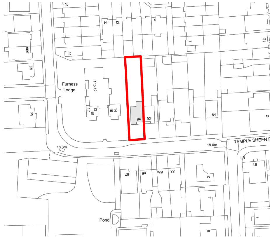
1 Existing Location Plan 1 : 1250 @ A3