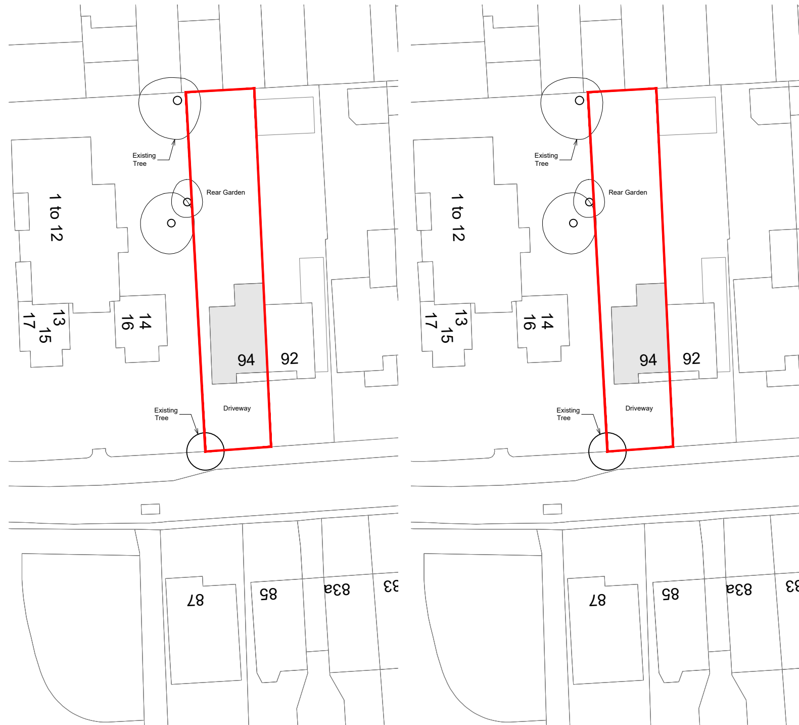
2 Existing Block Plan 1 : 500