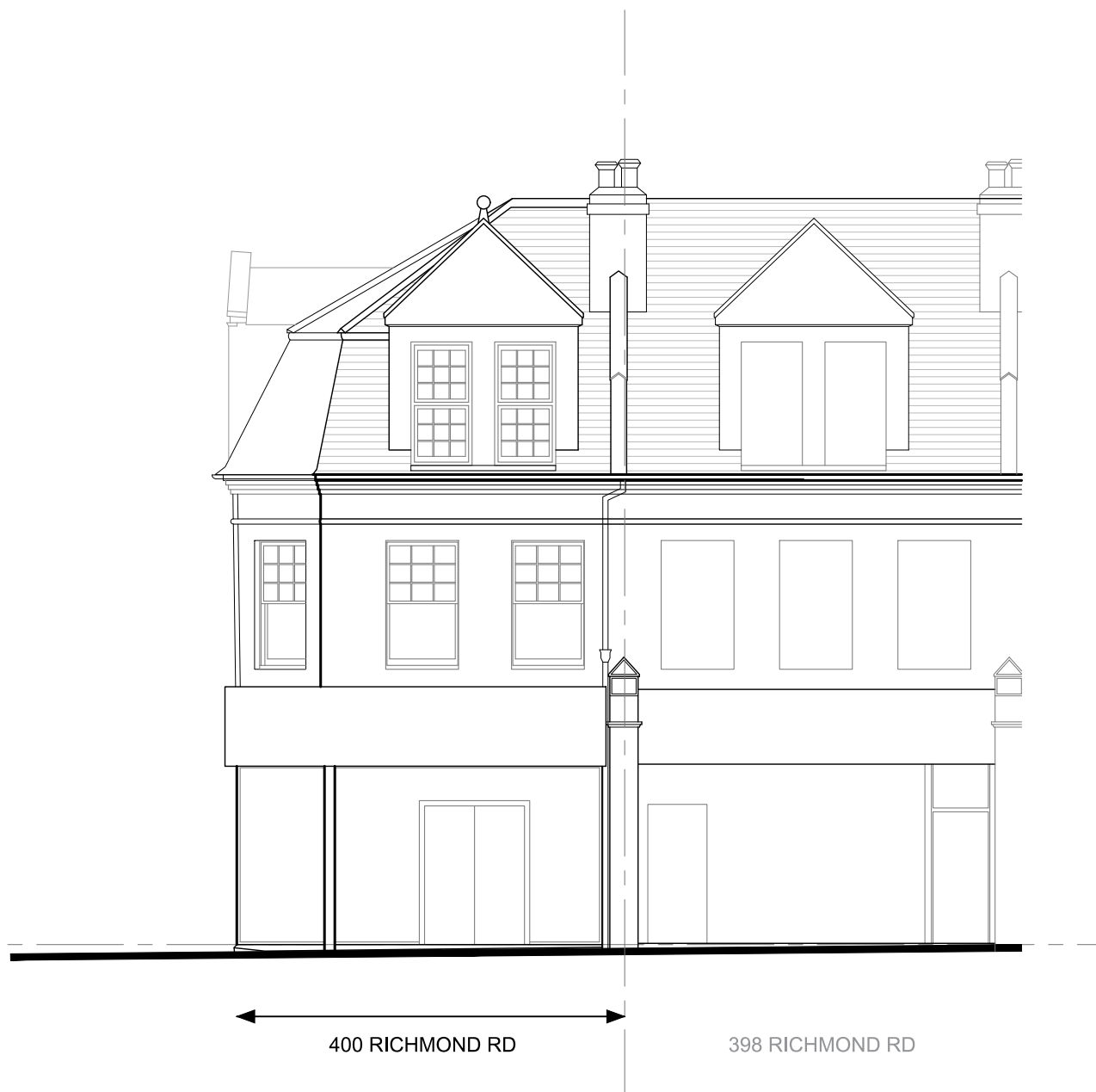
01 Front Elevation - Existing 1:100 @ A3