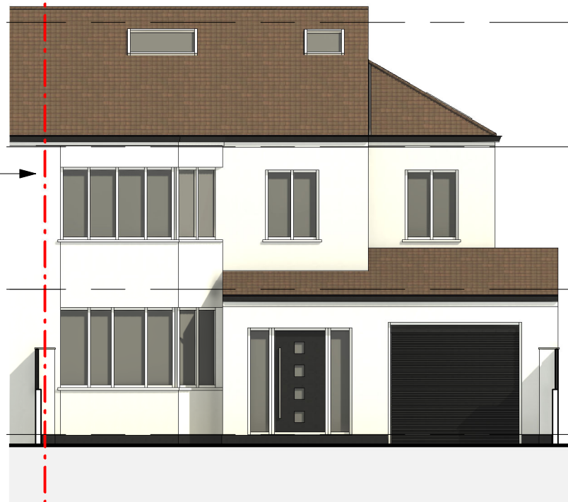
Existing Front 1:100

▼ Level 3 772 ▼ Level 2 539 Neighbor Estimated/ Not Surveyed ▼ Level 1 272 ▼ Level 0 0