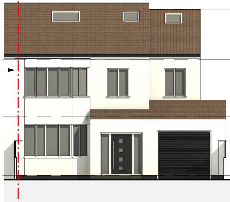
Proposed Front 1:100

▼ Level 3 772 ▼ Level 2 539 Neighbor Estimated/ Not Surveyed ▼ Level 1 272 ▼ Level 0 0