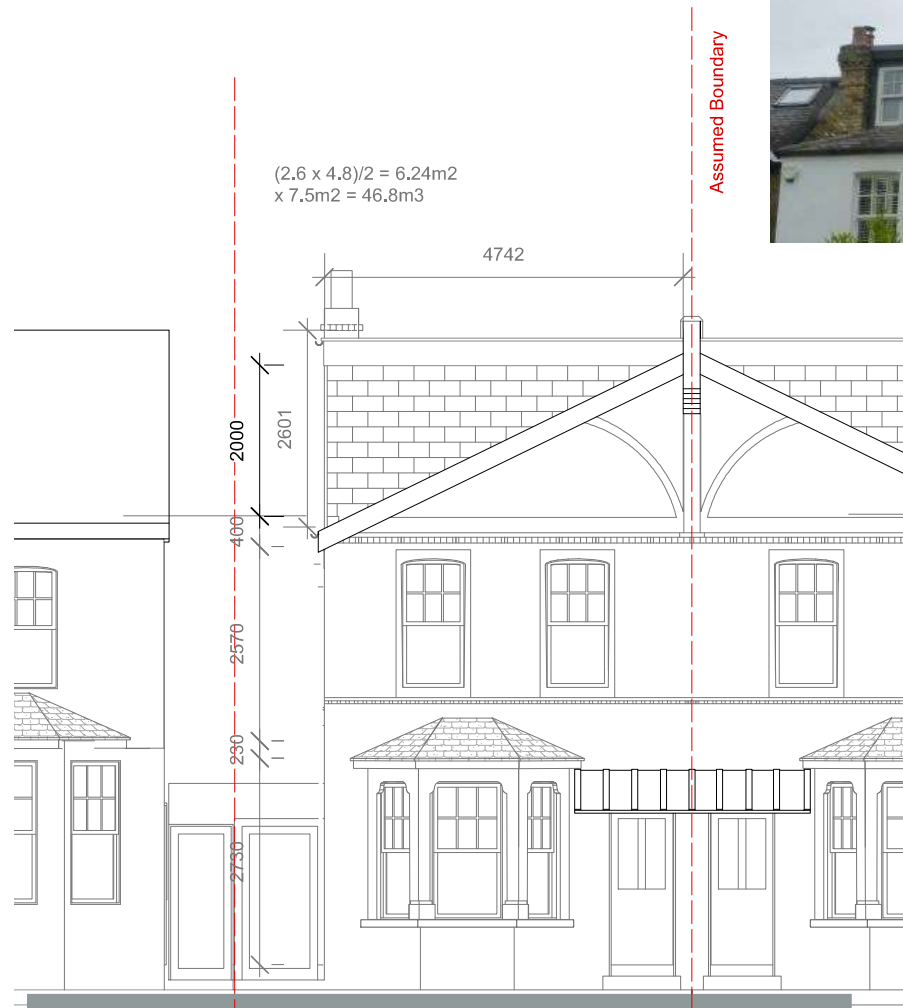
1 Front ele Scale: 1:100