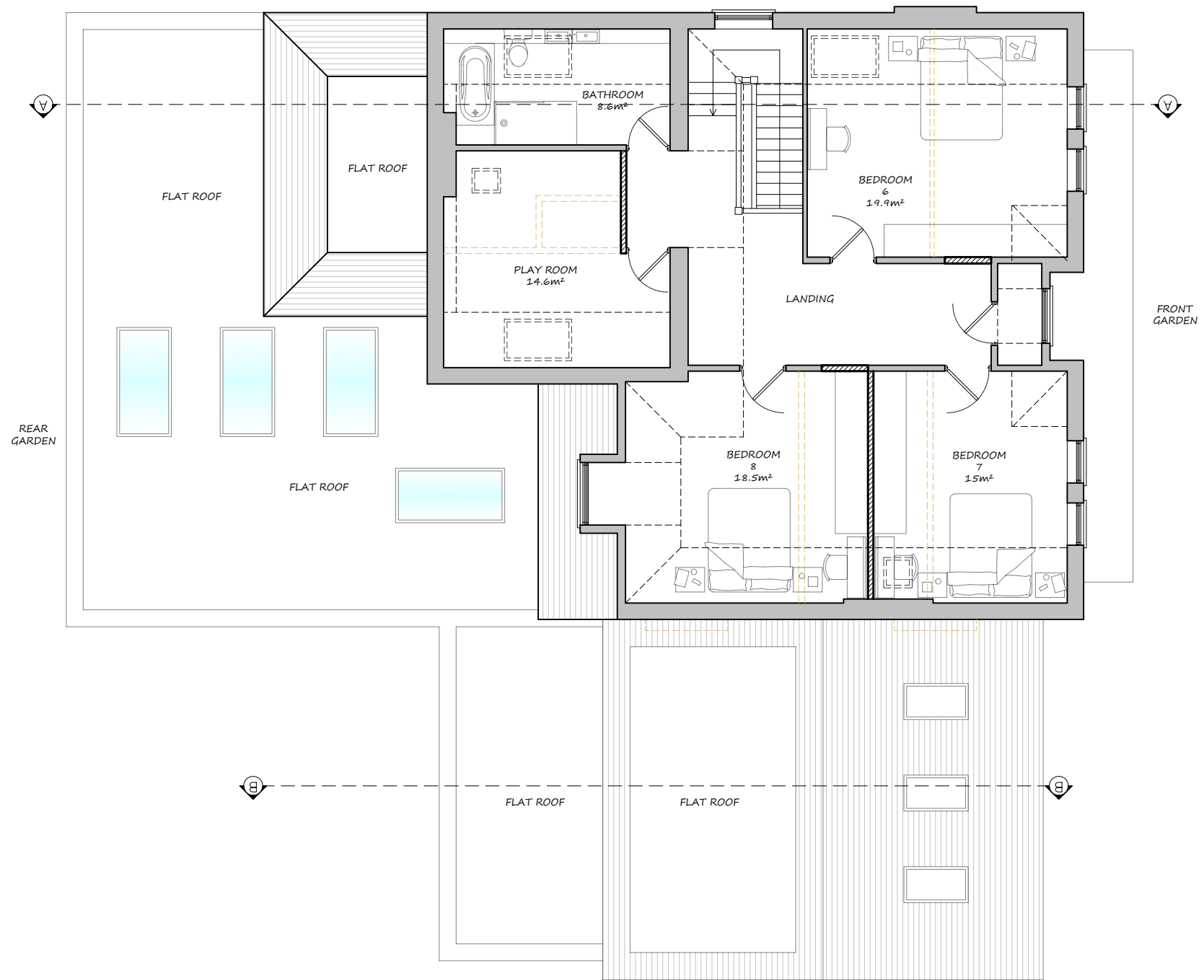
PROPOSED SECOND FLOOR PLAN 1:100