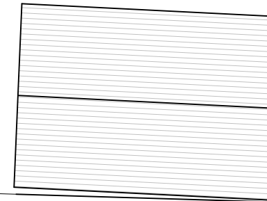
PROPOSED ROOF PLAN 1:100