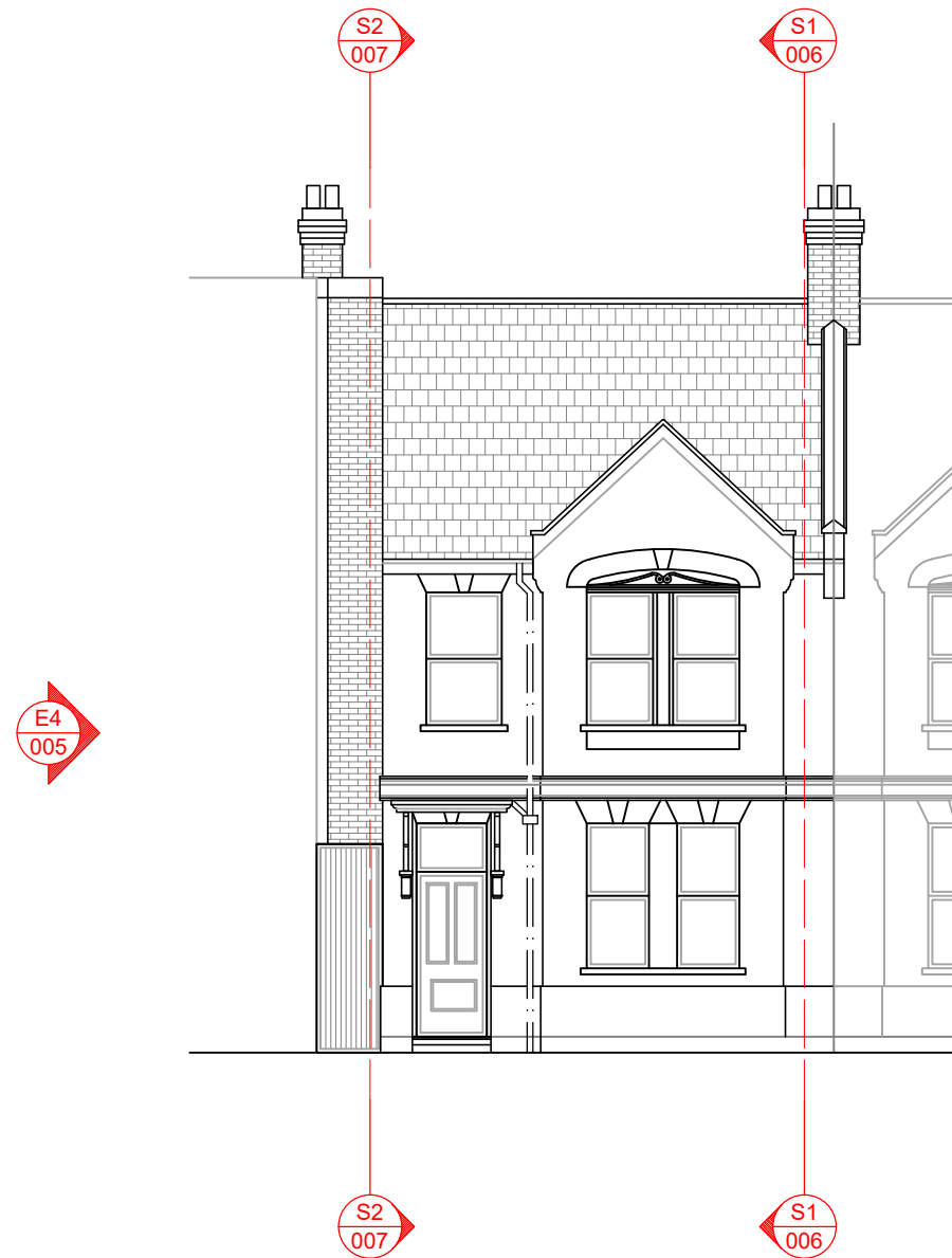
01 Existing Front Elevation E1 1:100 @ A3