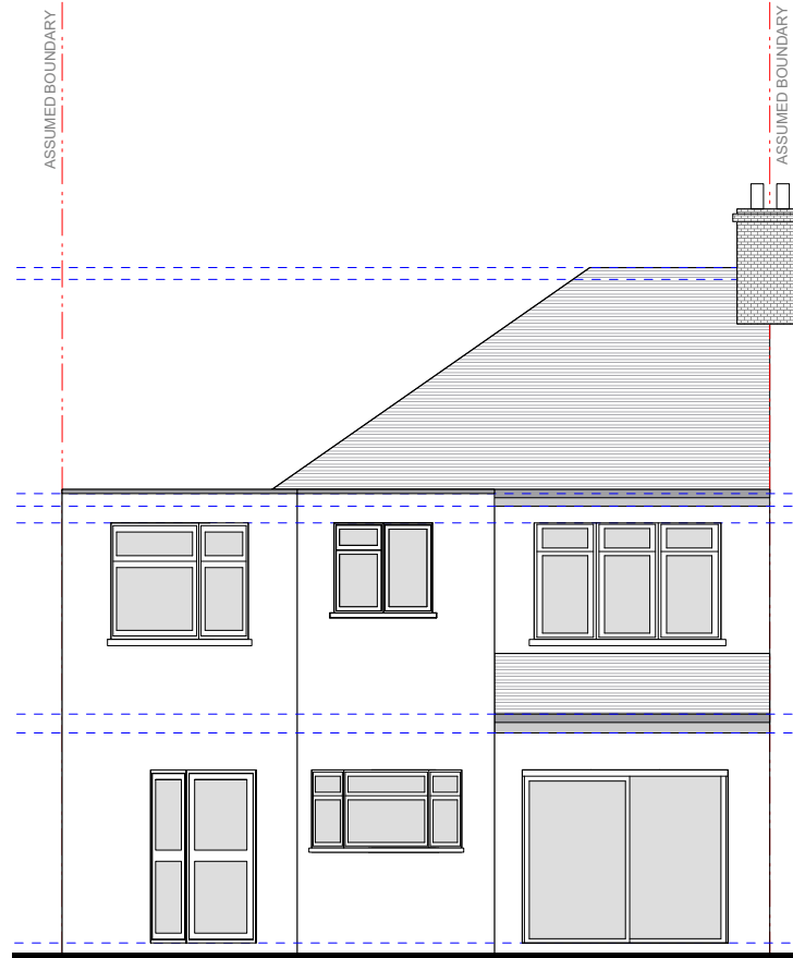
1 REAR ELEVATION PR-20 Scale: 1/100