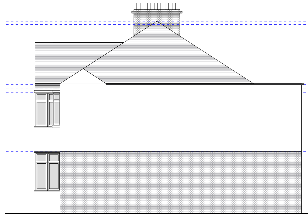
1 SIDE ELEVATION PR-20 Scale: 1/100