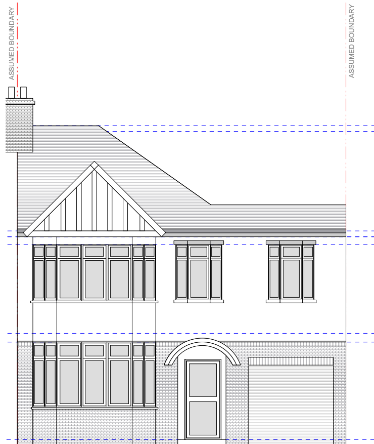
1 FRONT ELEVATION PR-20 Scale: 1/100