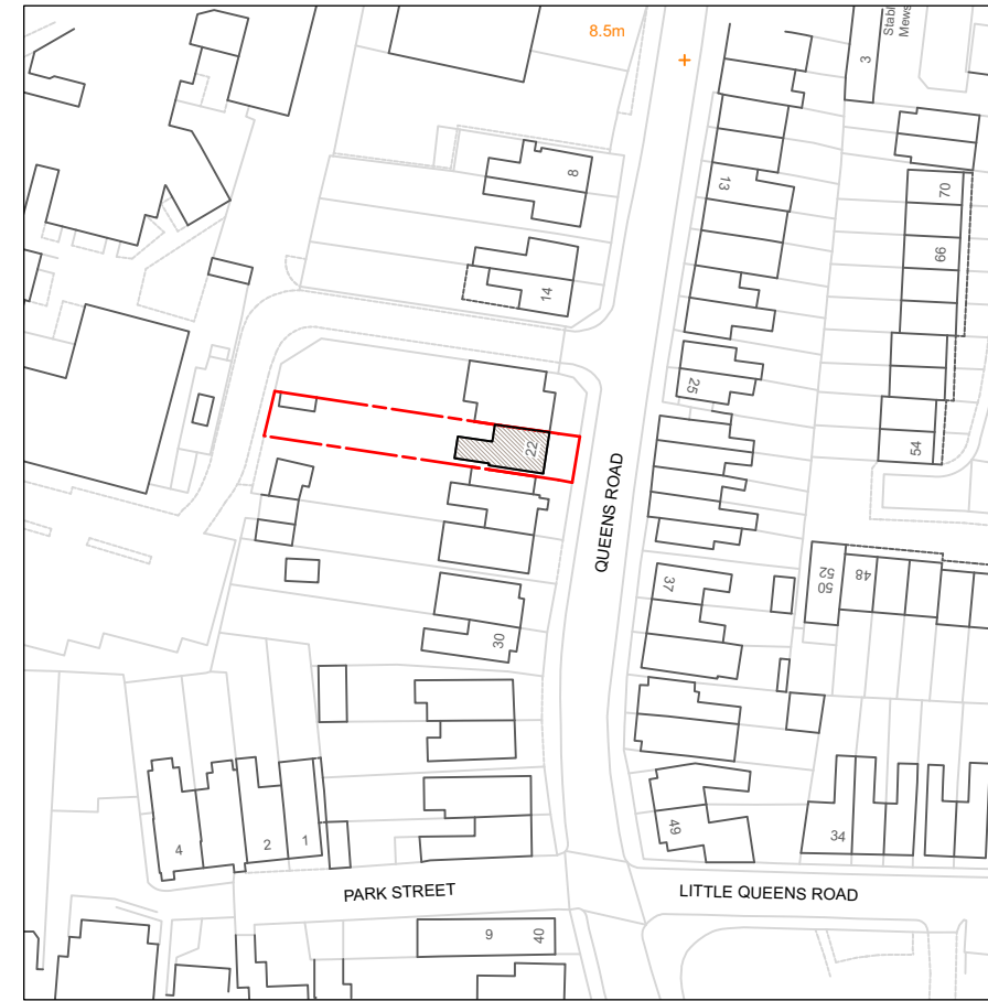
Proposed Block Plan - 1:1250