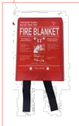
Fire Blanket in the Kitchen.