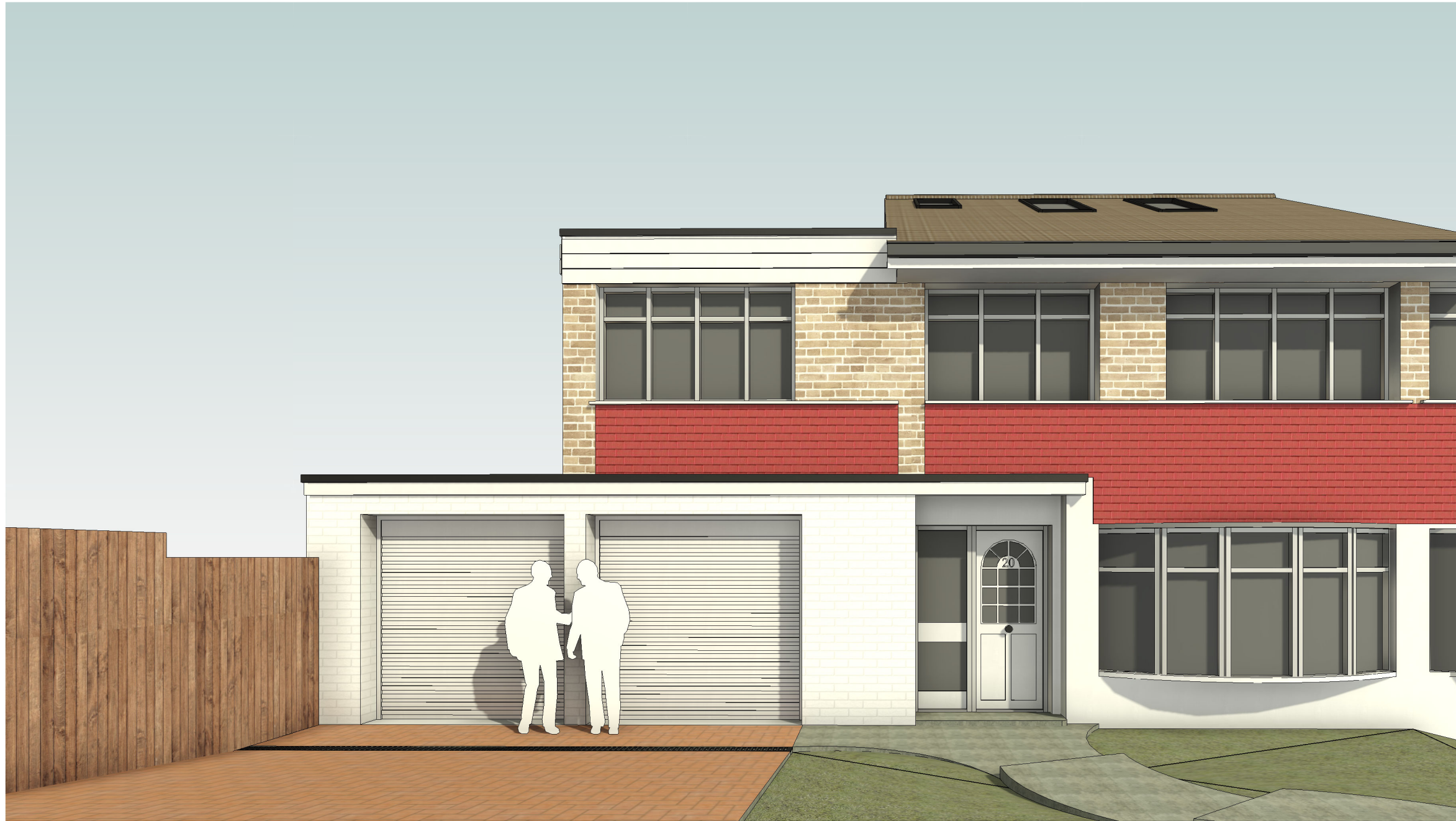
Proposed 3D View 03 Perspective