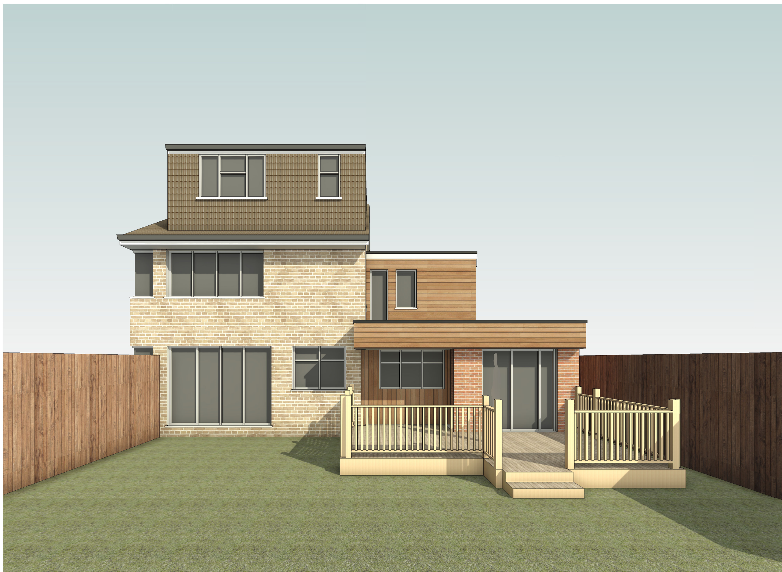
Proposed 3D View 04 Perspective