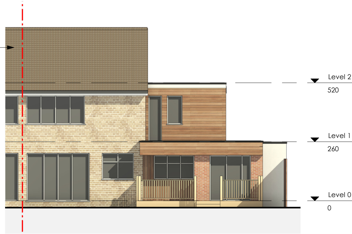
Existing Rear 1:100