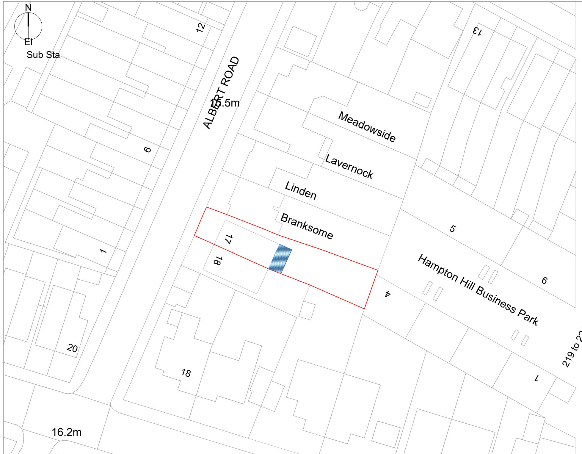
PROPOSED BLOCK PLAN SCALE 1:500