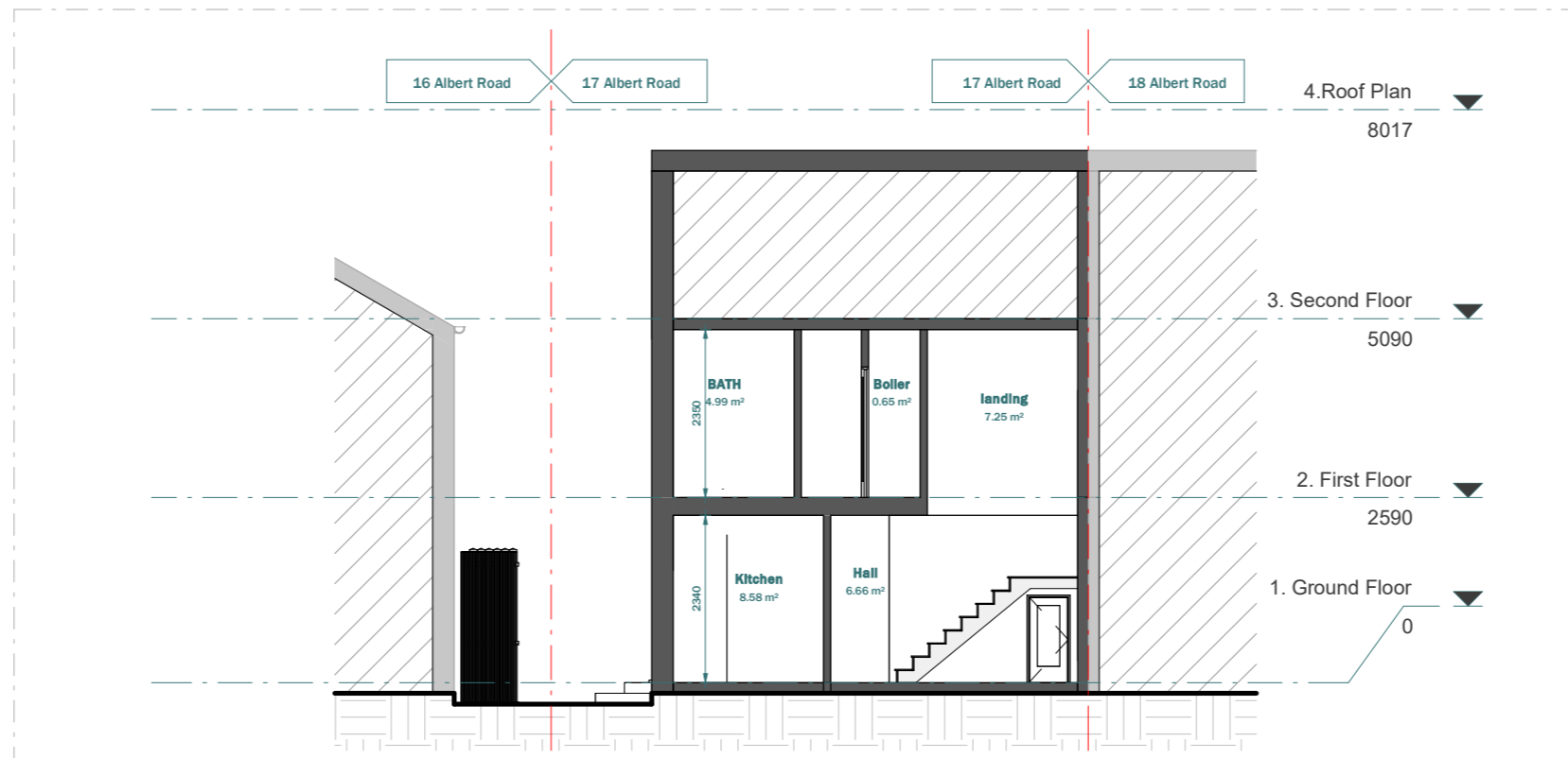
EXISTING SECTION A - A