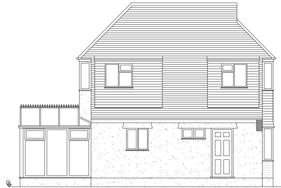
Side (S/W) Elevation Existing