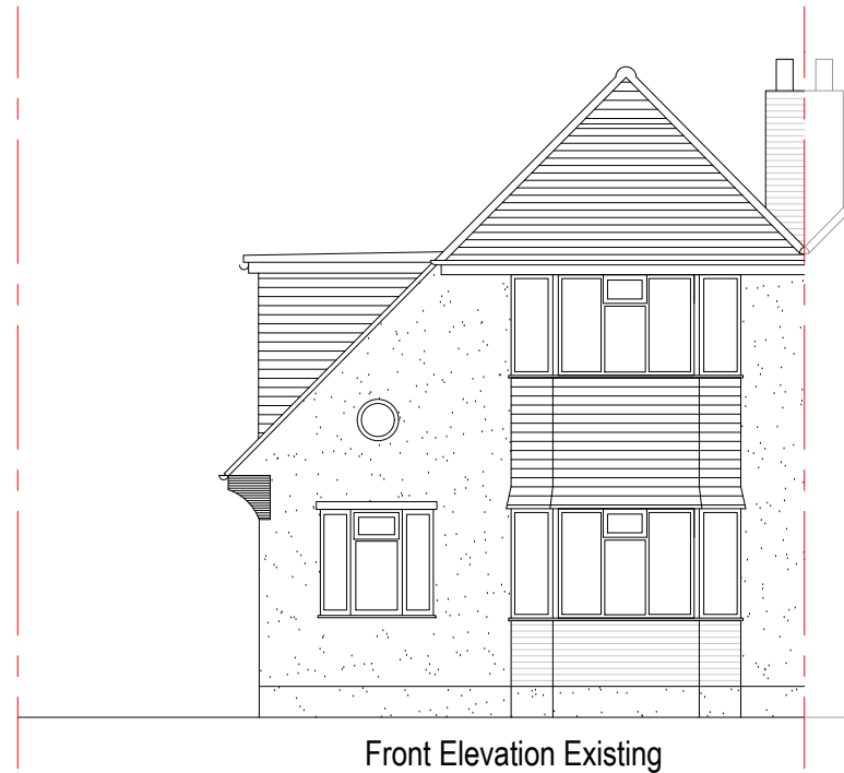
Front Elevation Existing