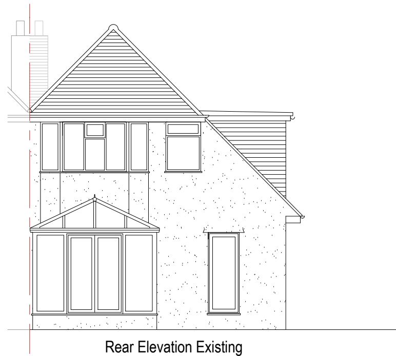
Rear Elevation Existing