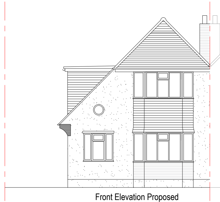
Front Elevation Proposed