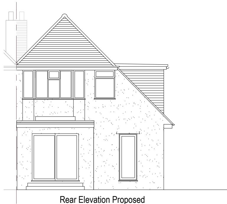
Rear Elevation Proposed