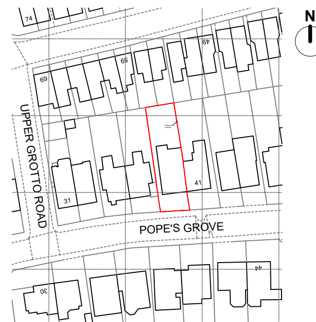
Block Map 1:1250

© Crown copyright 2024 Ordnance Survey 100053143