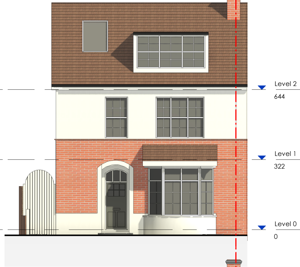
Existing Front 1:100