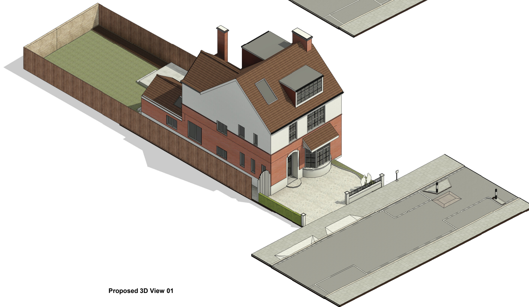
Proposed 3D View 01