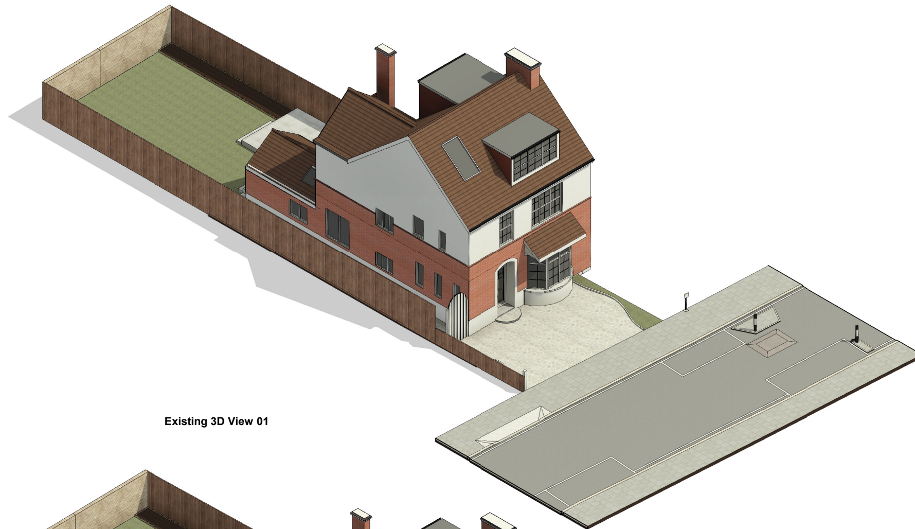
Existing 3D View 01