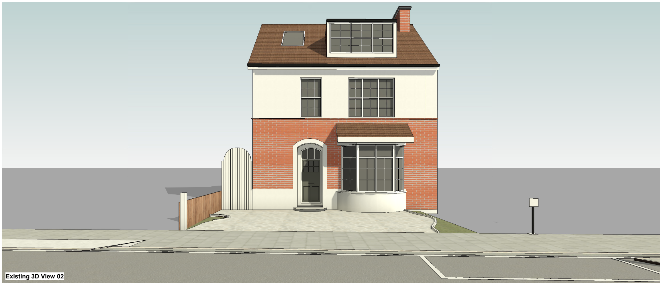
Existing 3D View 02