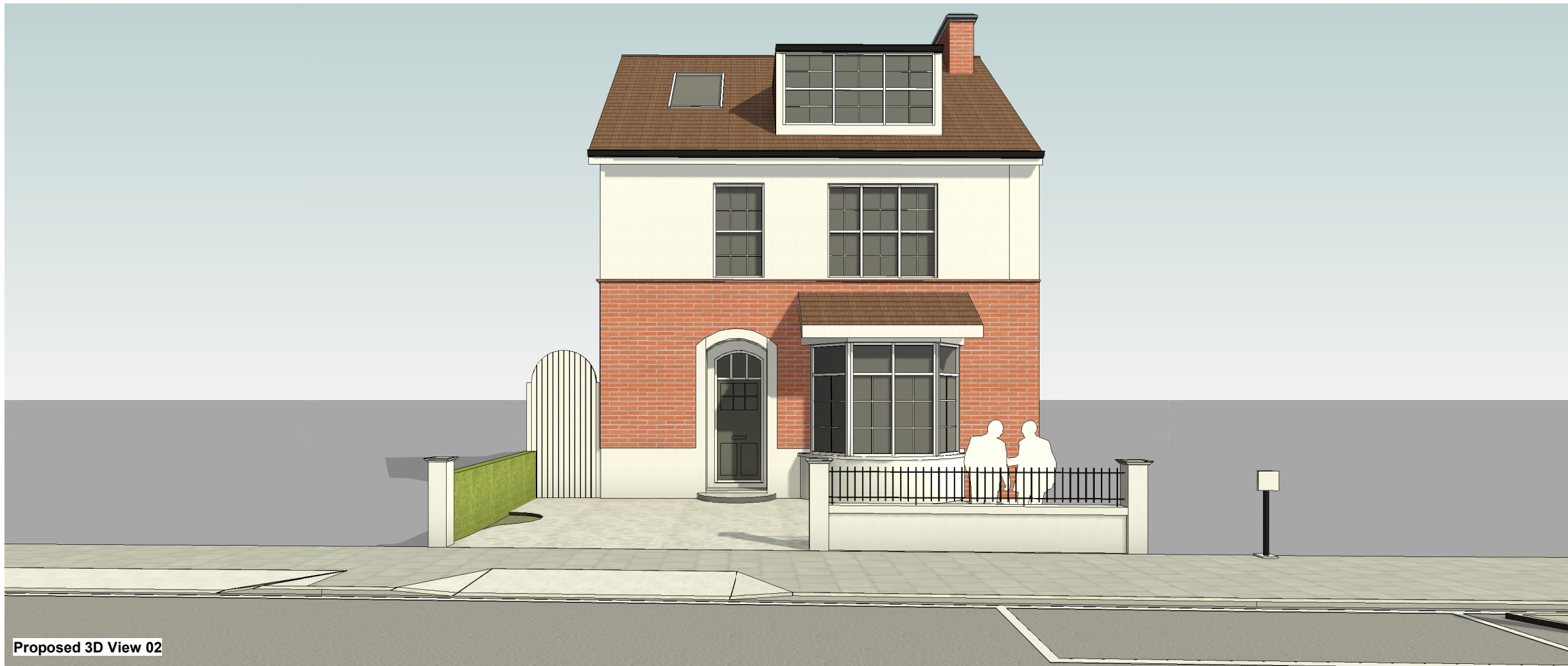
Proposed 3D View 02