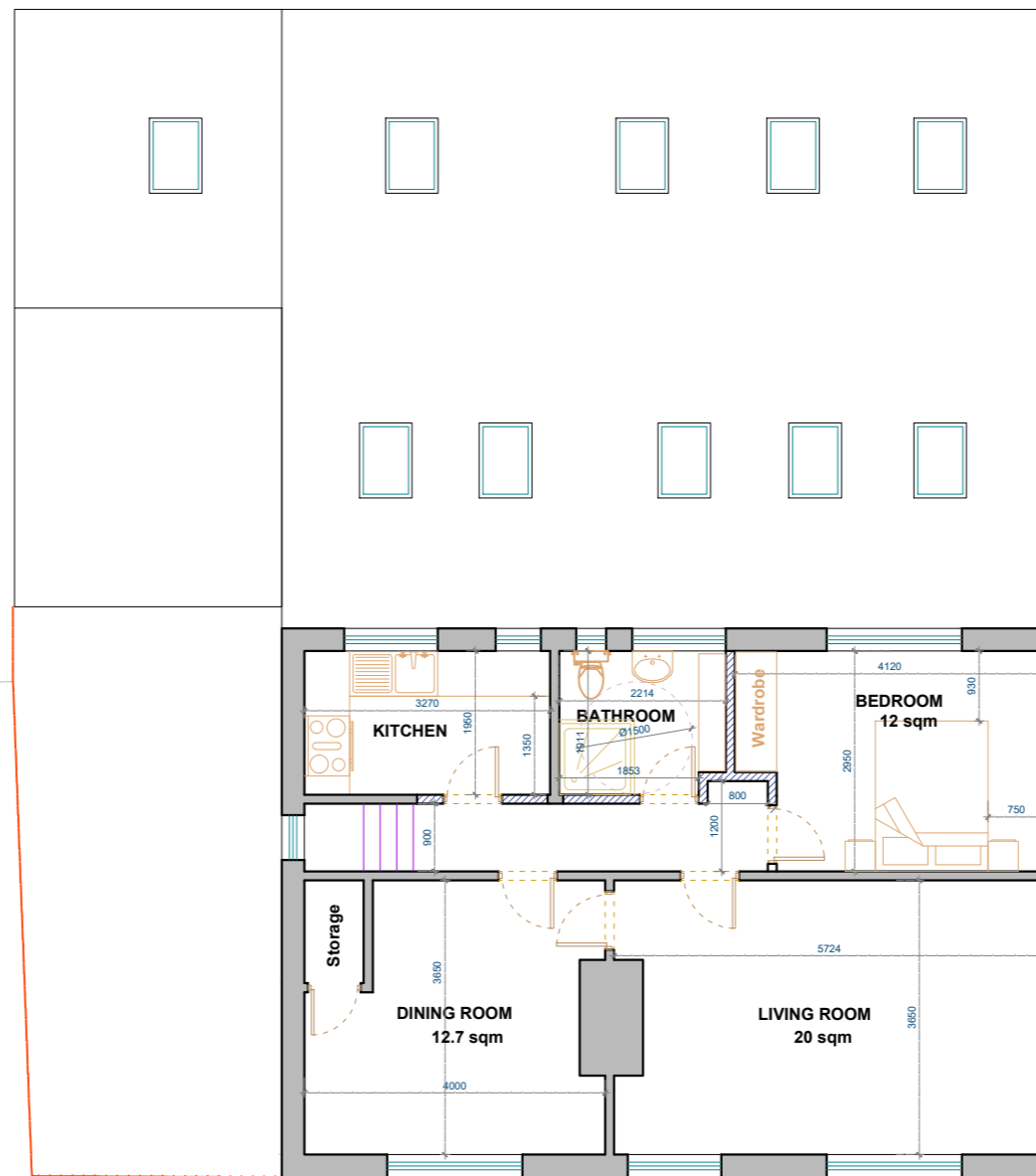
2 PROPOSED FIRST FLOOR PLAN SCALE 1:100 @ A3