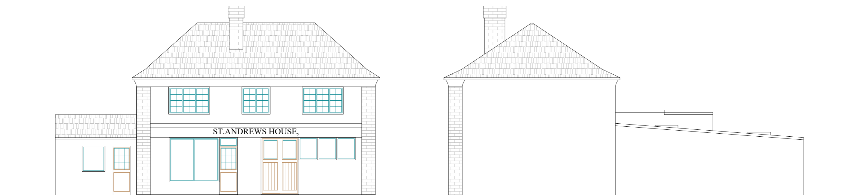
4 PROPOSED FRONT ELEVATION SCALE 1:100 @ A3

All dimensions are in millimeters unless noted otherwise. All dimensions to be verified on site. For any discrepancies and omissions, it is recipient's responsibility to verify the same specifically with the designer. The copyright of this drawing is held by ALL1HOUSE. No unauthorized use or copies are permitted without our consent.