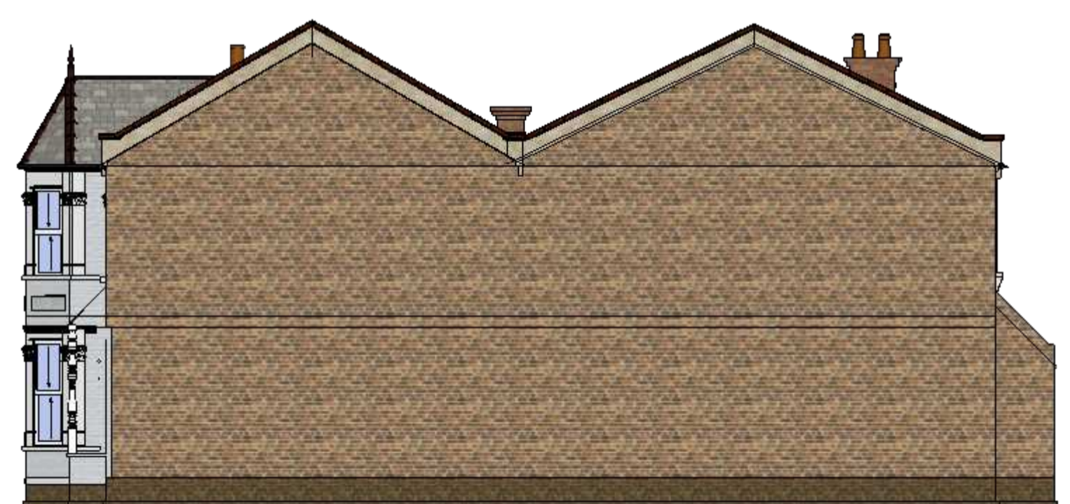
A 01 | EXISTING SIDE ELEVATION | scale: 1:100