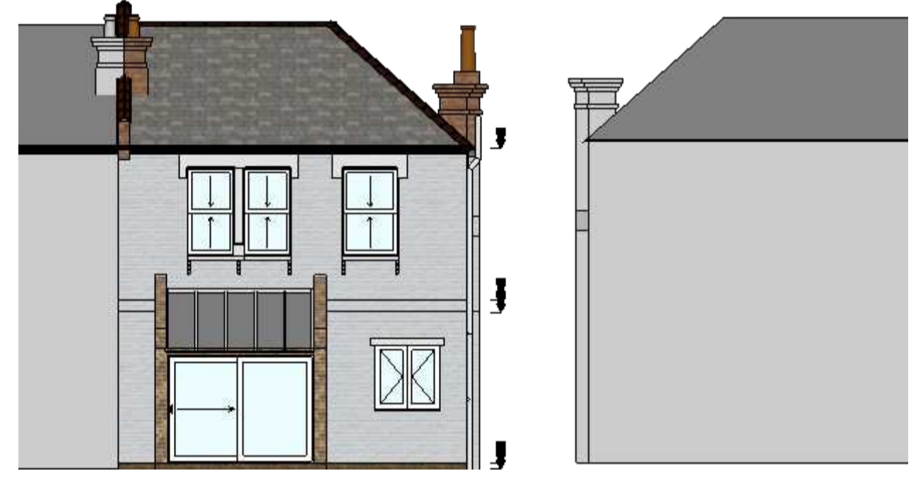
A 01 | EXISTING REAR ELEVATION | scale: 1:100