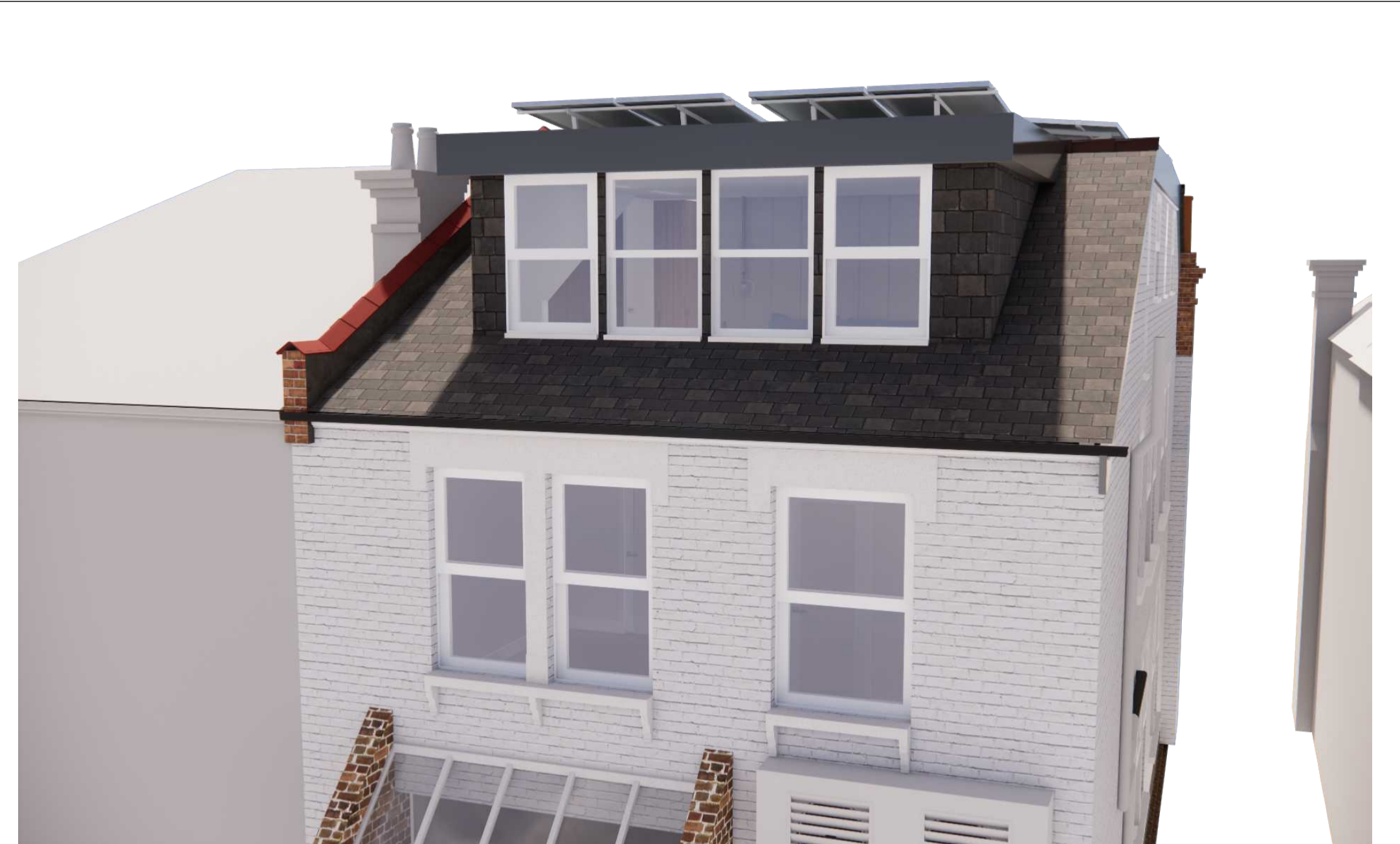
A 01 | PROPOSED VIEW | scale: