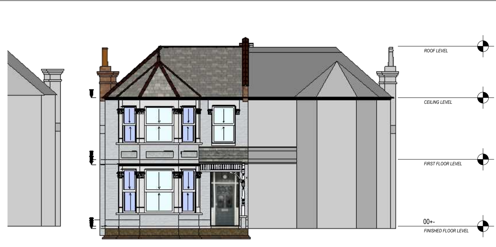
A 01 | EXISTING FRONT ELEVATION | scale: 1:100