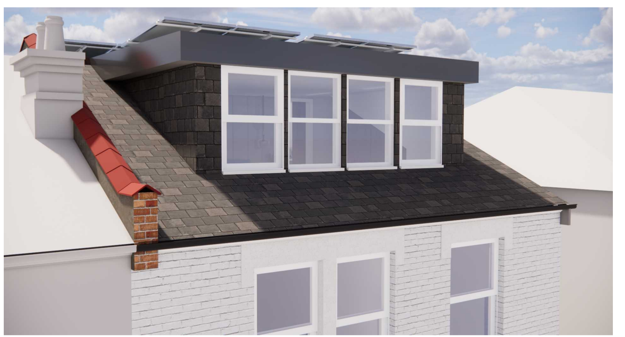
A 01 | PROPOSED VIEW | scale: