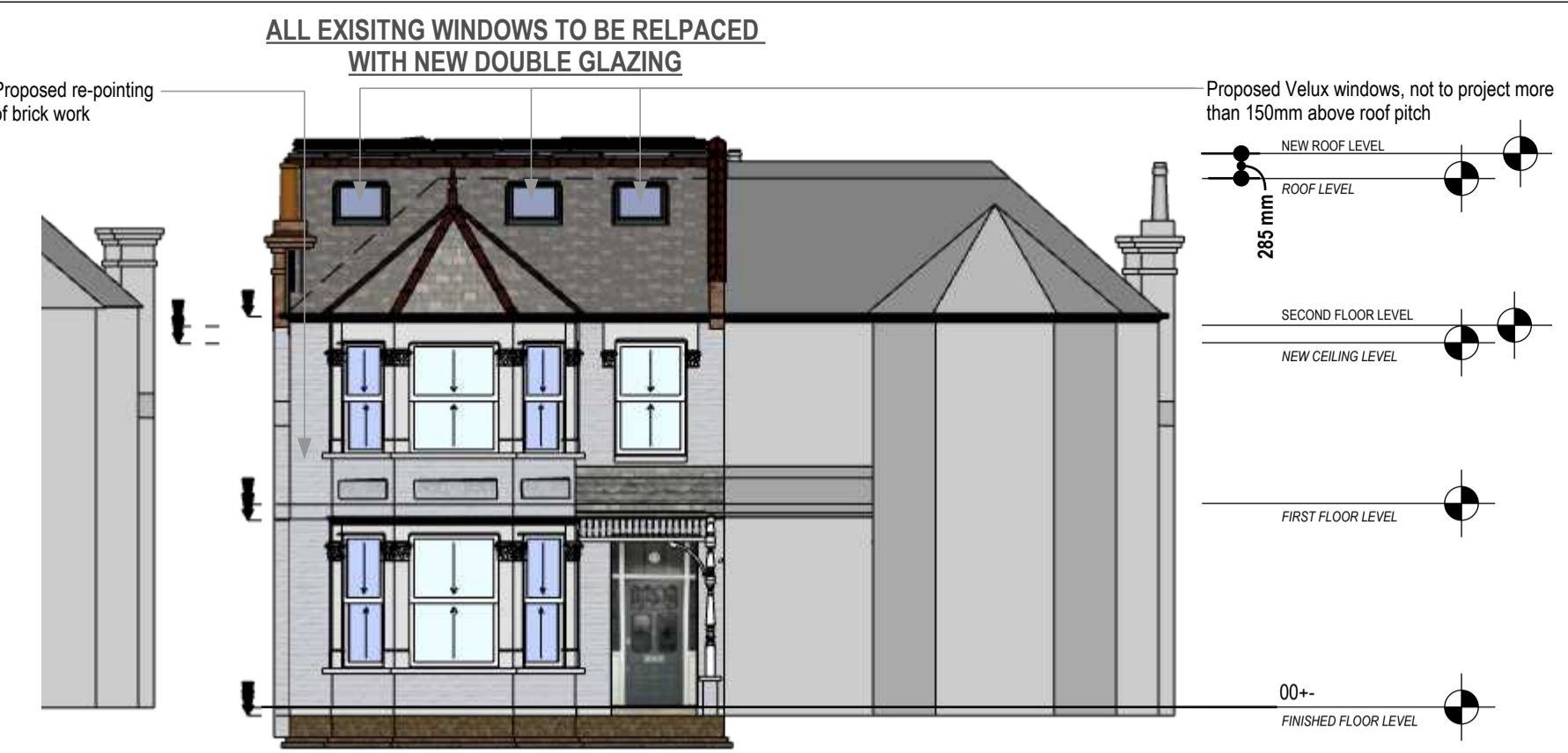
A 01 | PROPOSED FRONT ELEVATION | scale: 1:100