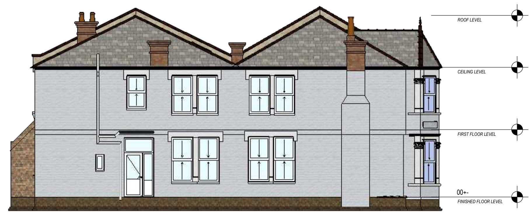
A 01 | EXISTING SIDE ELEVATION | scale: 1:100