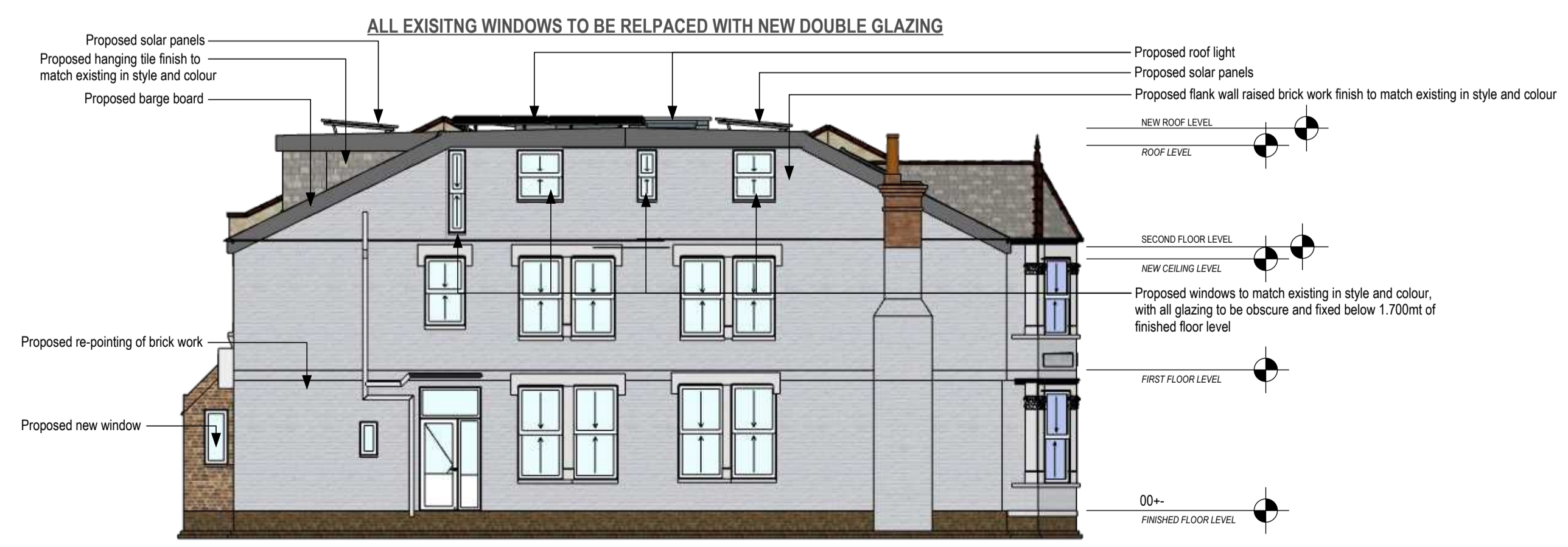
A 01 | PROPOSED SIDE ELEVATION | scale: 1:100