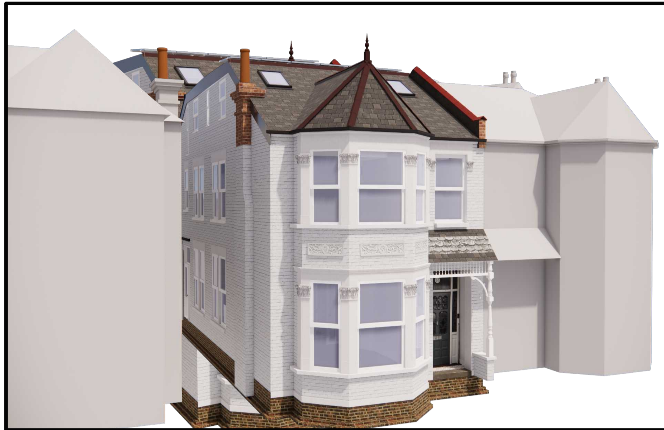
A 01 PROPOSED VIEW scale: