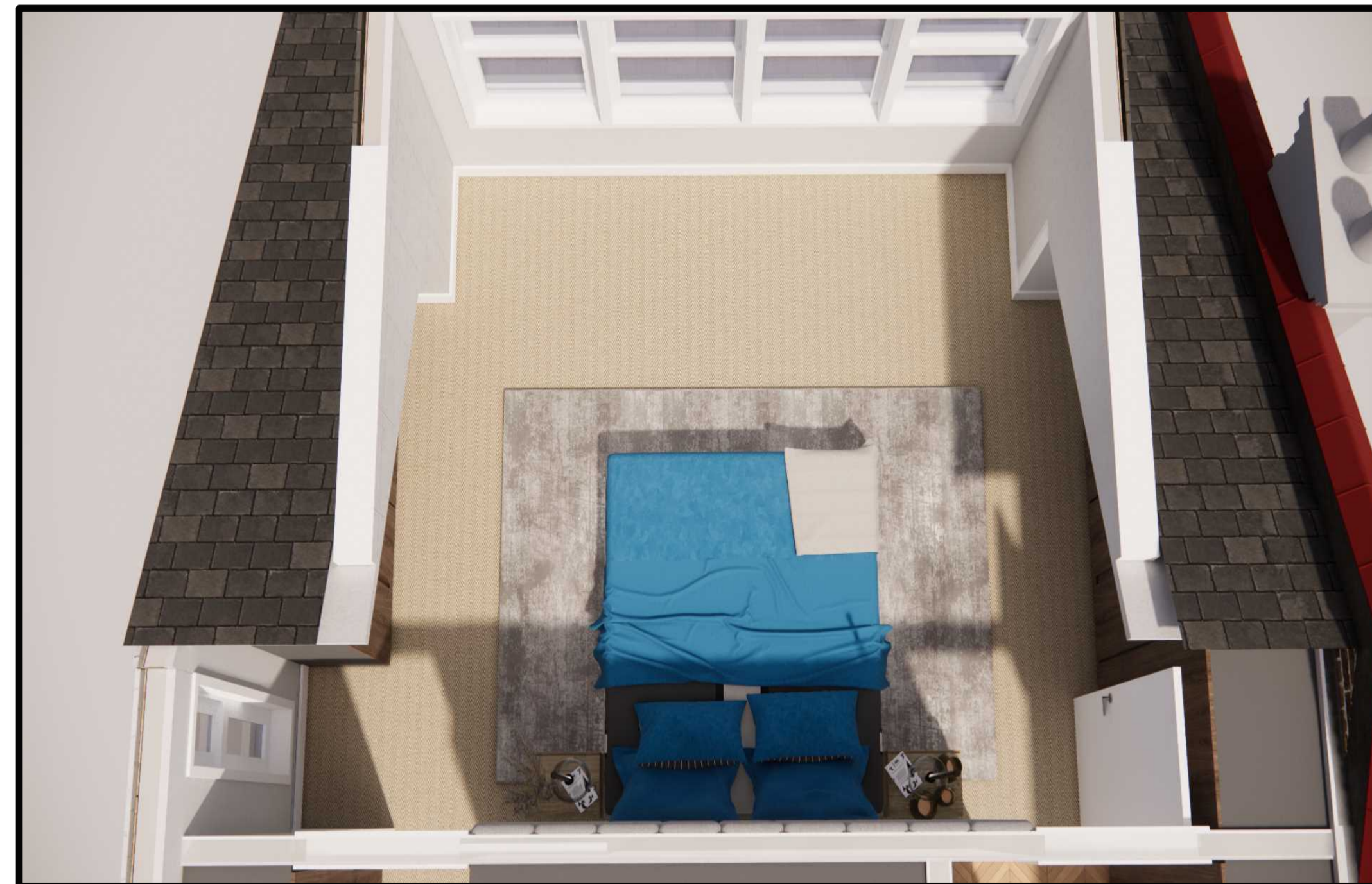
A 01 PROPOSED VIEW scale: