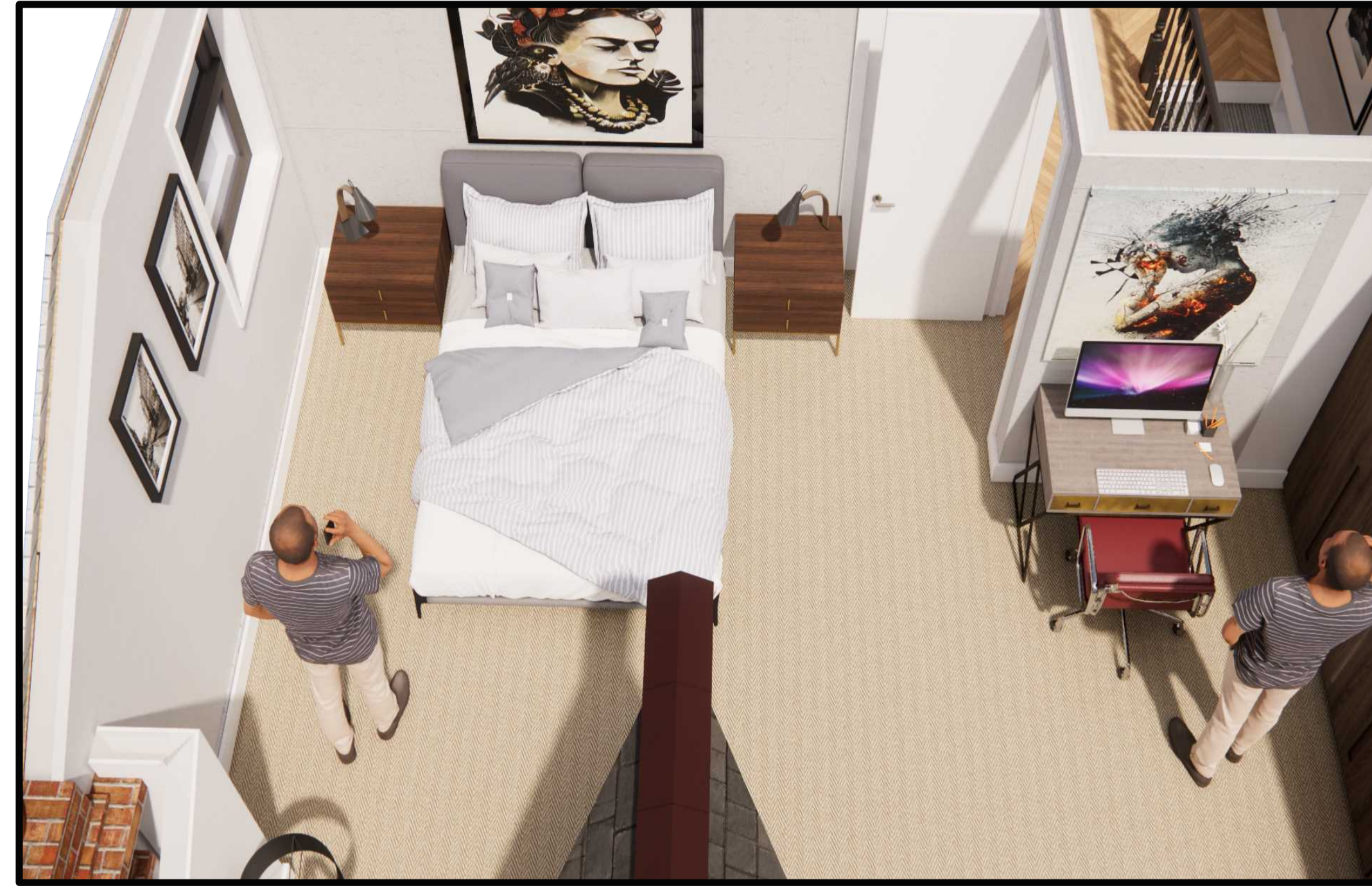
A 01 PROPOSED VIEW scale: