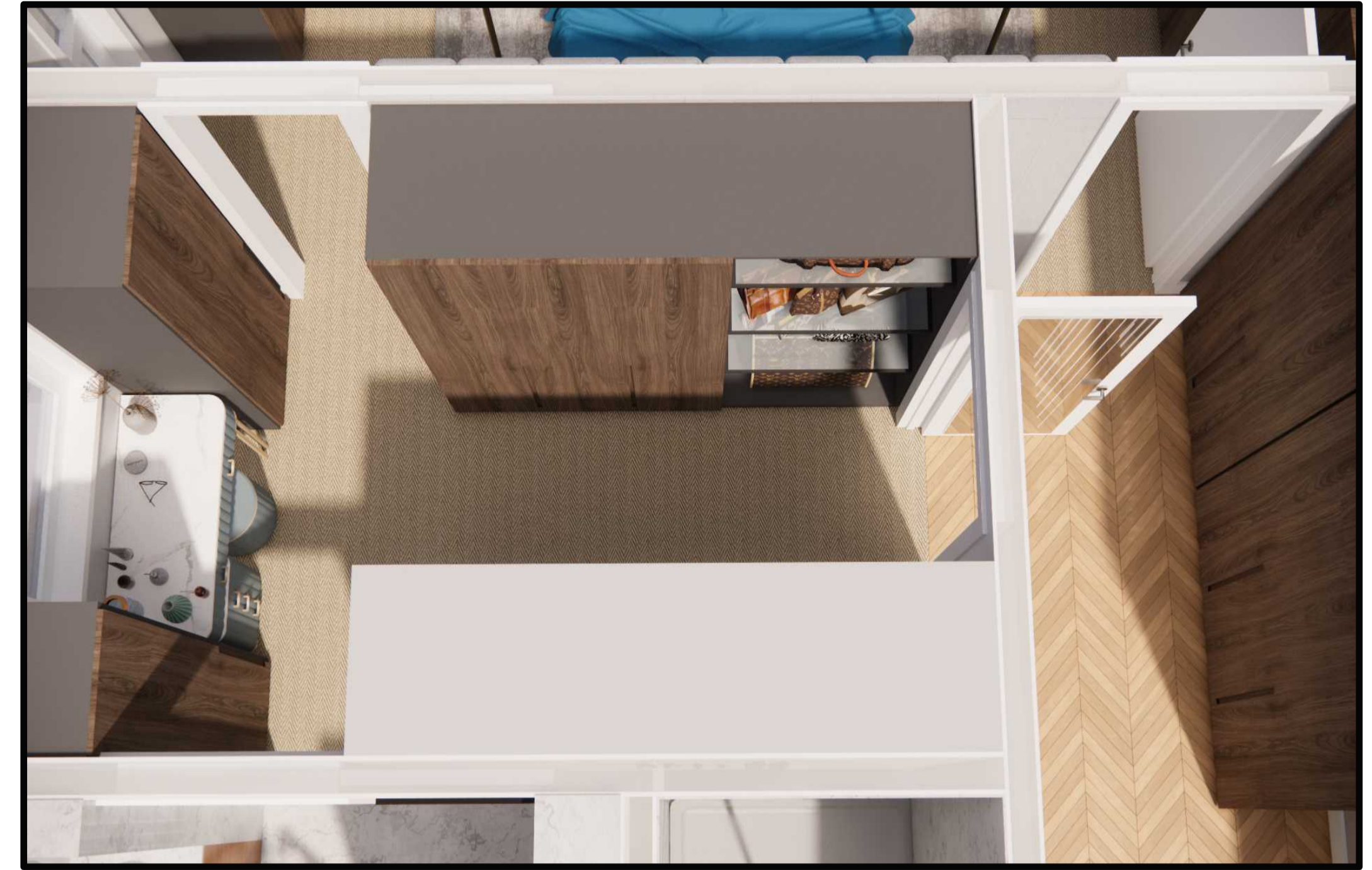
A 01 PROPOSED VIEW scale: