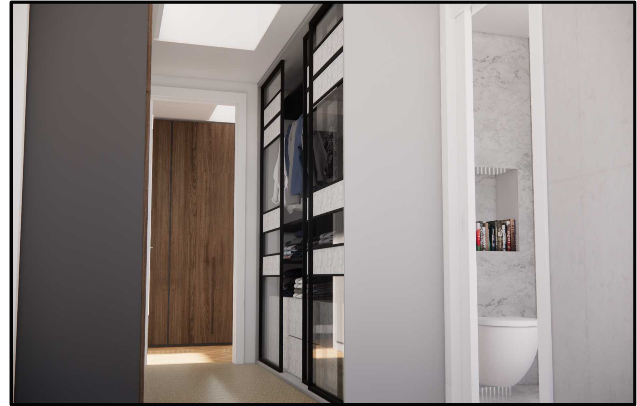
A 01 PROPOSED VIEW scale: