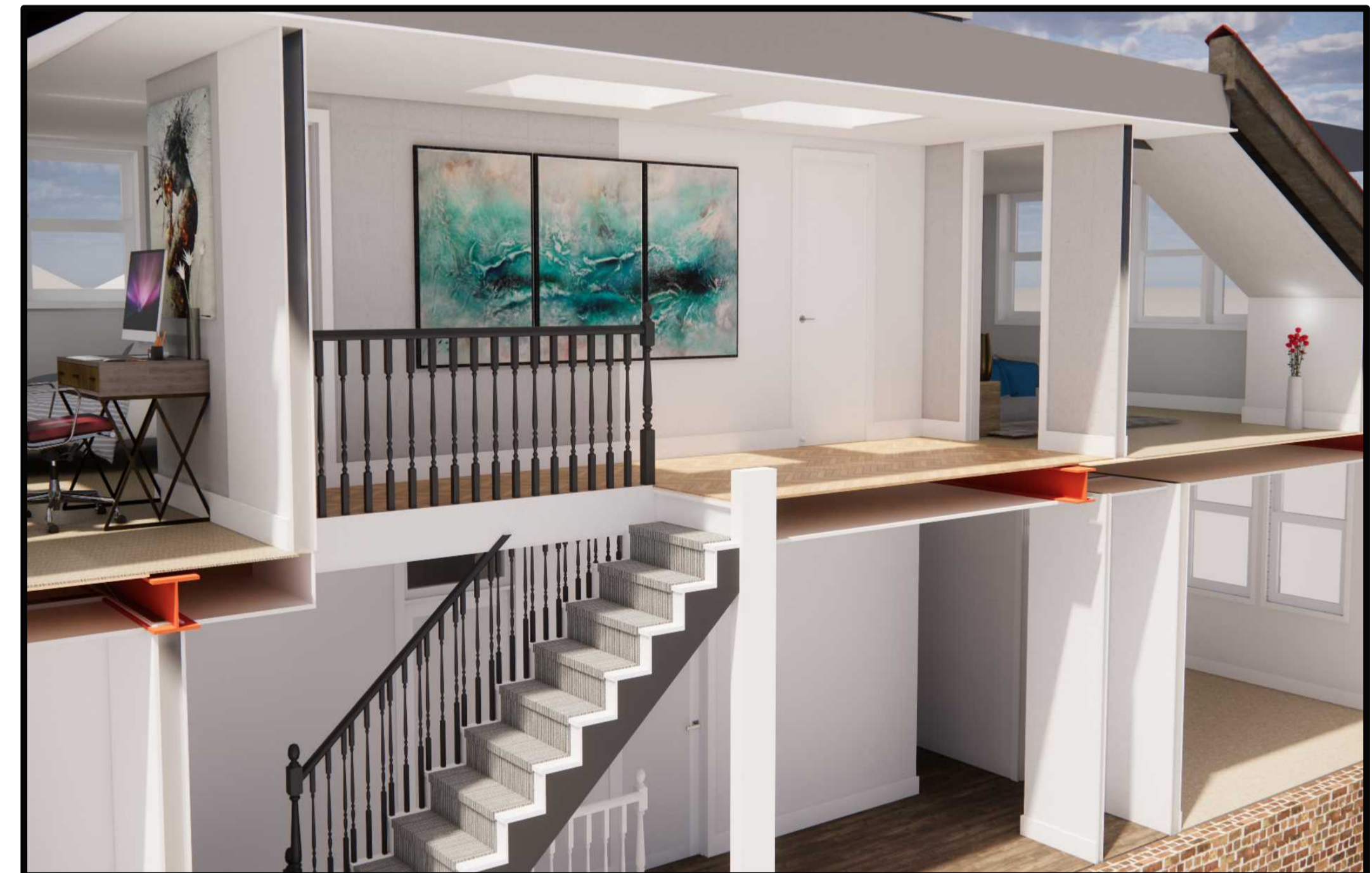
A 01 PROPOSED VIEW scale: