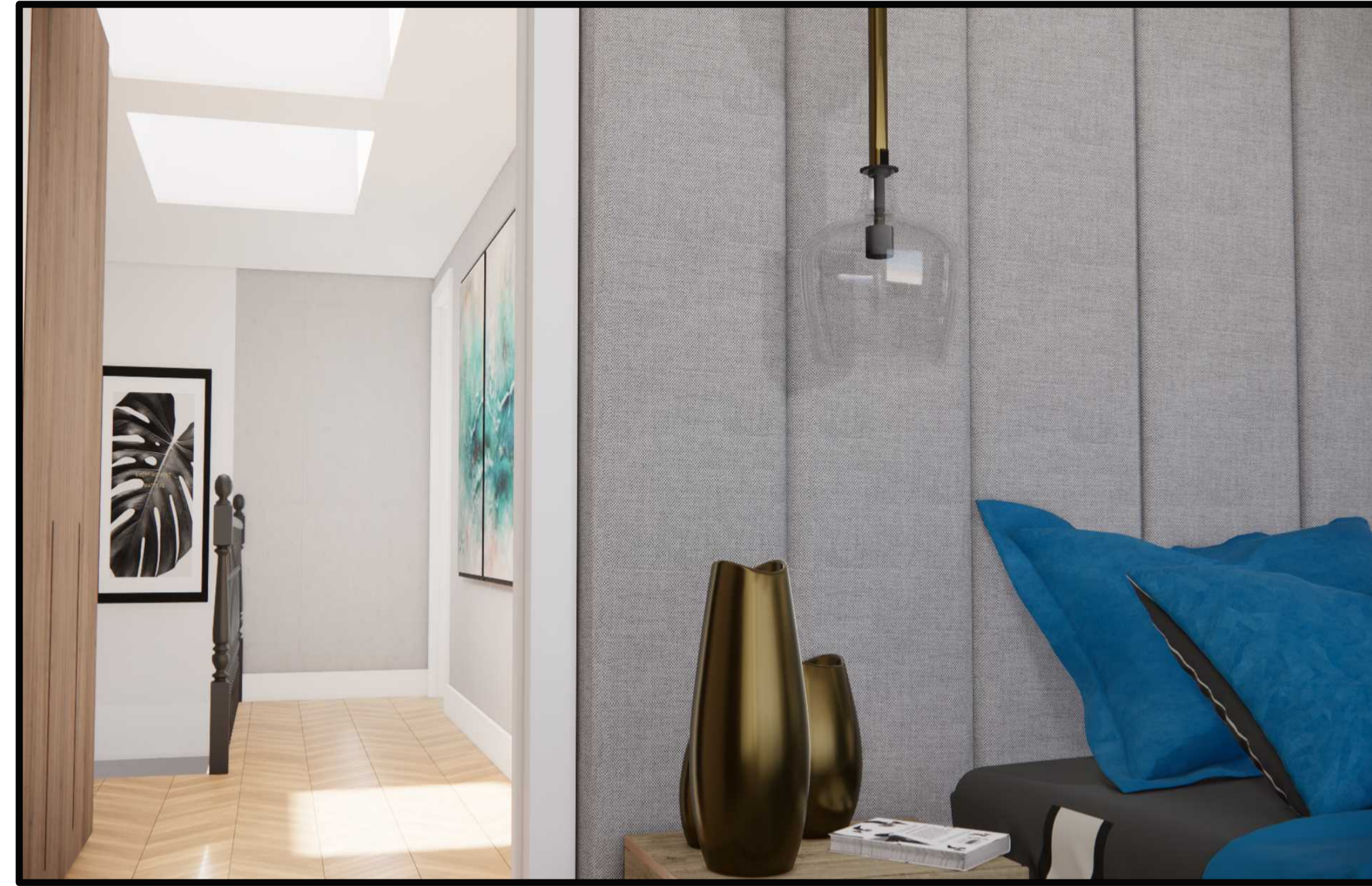
A 01 PROPOSED VIEW scale: