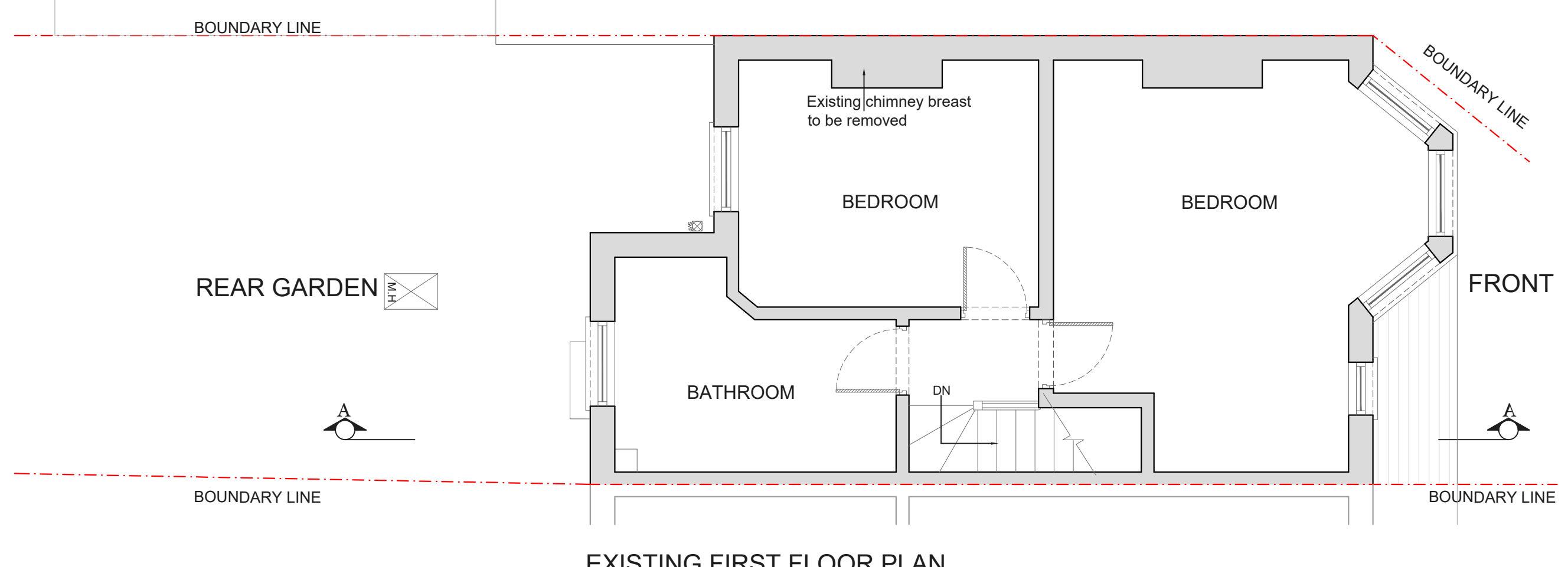
EXISTING FIRST FLOOR PLAN SCALE 1:50