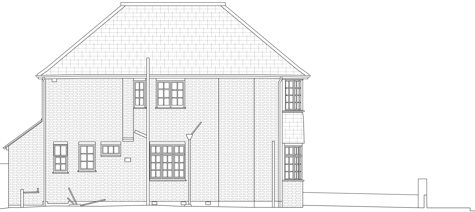
SIDE - NORTH