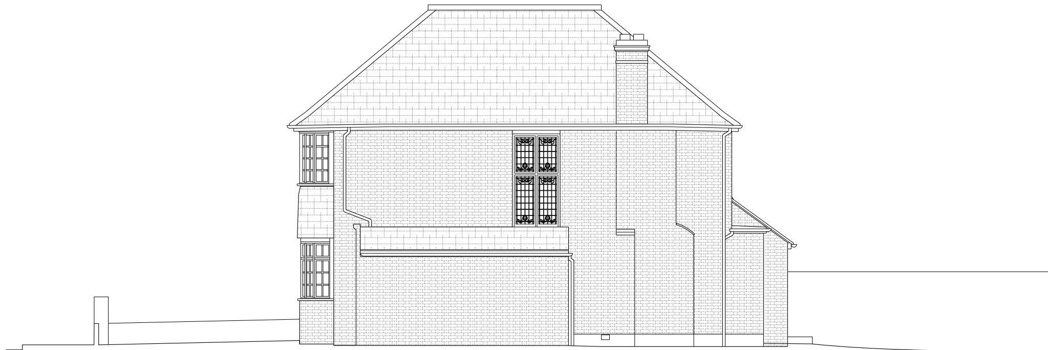
SIDE - SOUTH