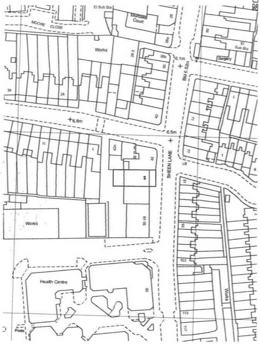
1 Location Plan 12300 Scale = 1:1250