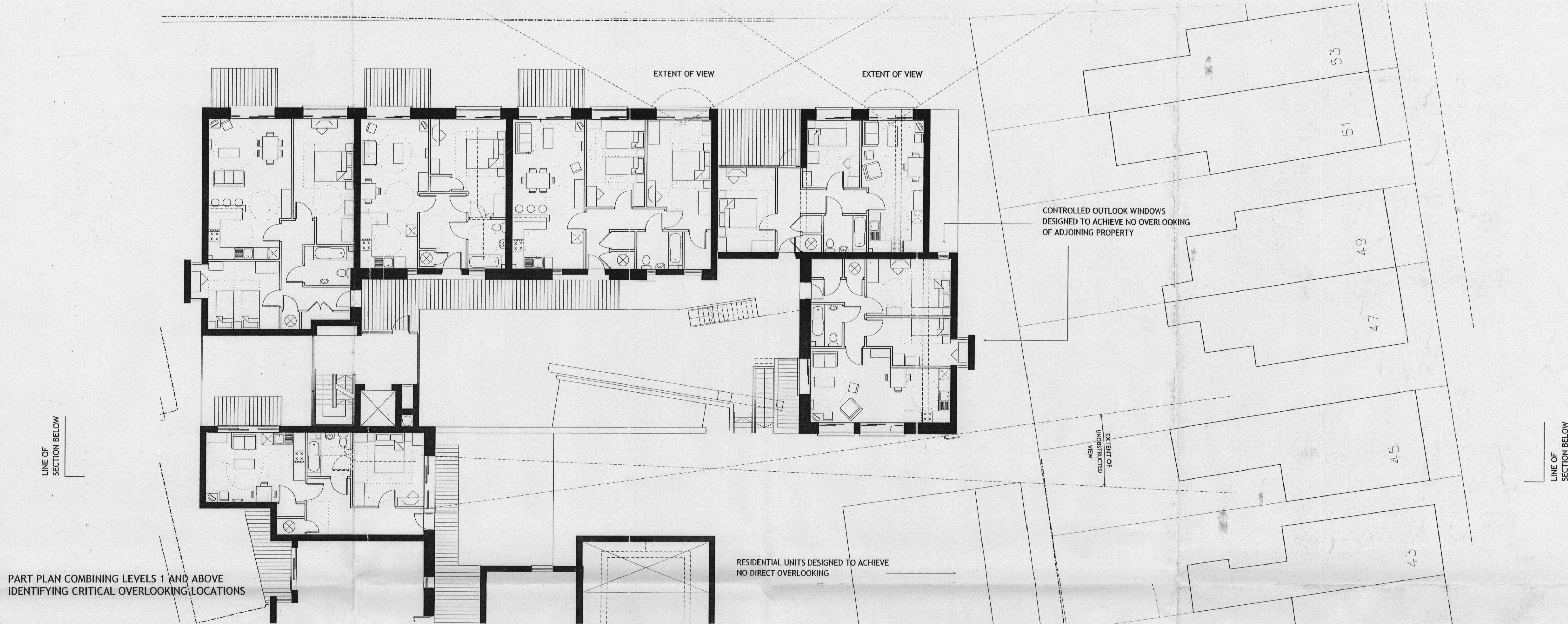
PART PLAN COMBINING LEVELS 1 AND ABOVE IDENTIFYING CRITICAL OVERLOOKING LOCATIONS