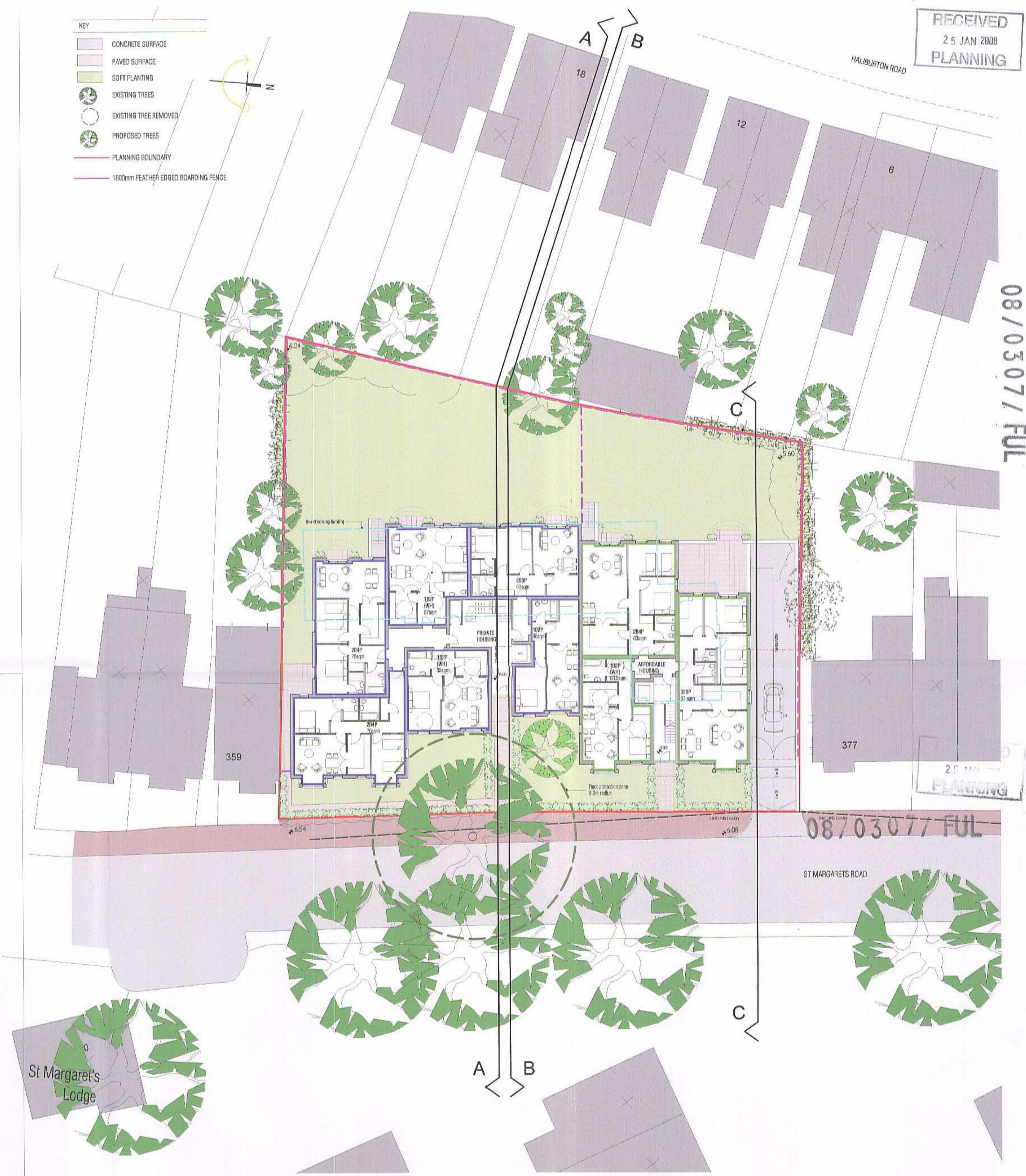
SITE LAYOUT 1:200