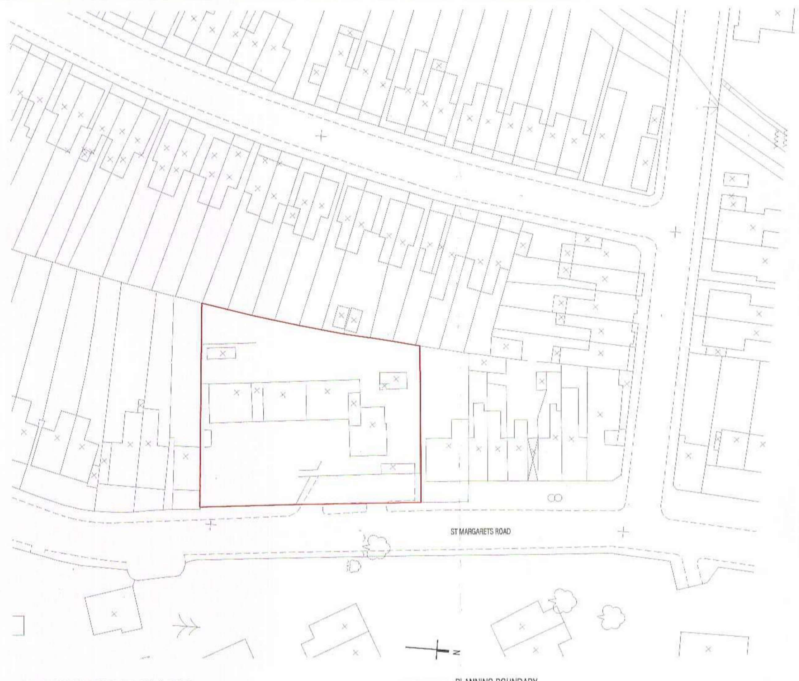
SITE LOCATION PLAN 1:500