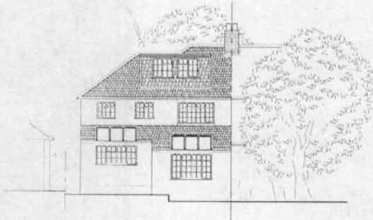
REAR ELEVATION (1:100)