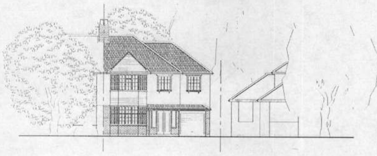
FRONT ELEVATION (1:100)